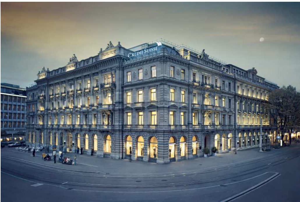
Credit Suisse, Zurich

since except for a short spell to another wealth manager to set up a Middle Eastern desk. He says of his return “the ‘project team’ environment at Credit