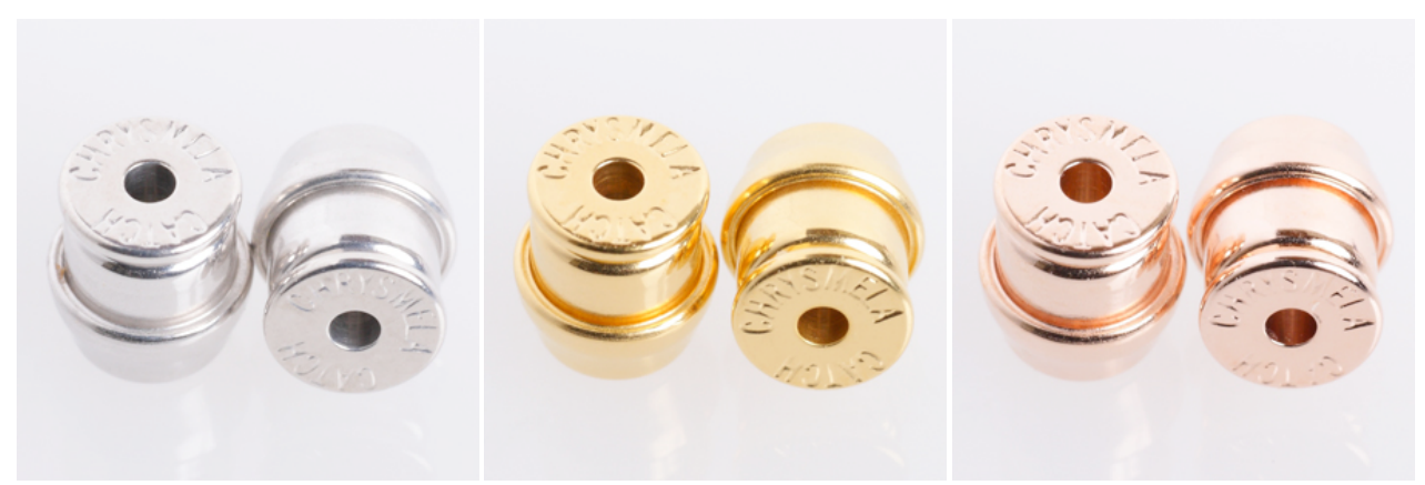
Close up of the lightweight Chrysmela Catch™ earring backs.