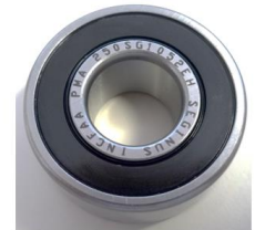
PMA Ball Bearing P/N 250SG1052EH

Also check out our company page on LinkedIn.