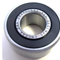
PMA Ball Bearing P/N 250SG1052-9EH