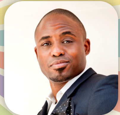
Wayne Brady Emmy Award Winner, Grammy Nominee, Actor, Singer, Improviser, and Dancer