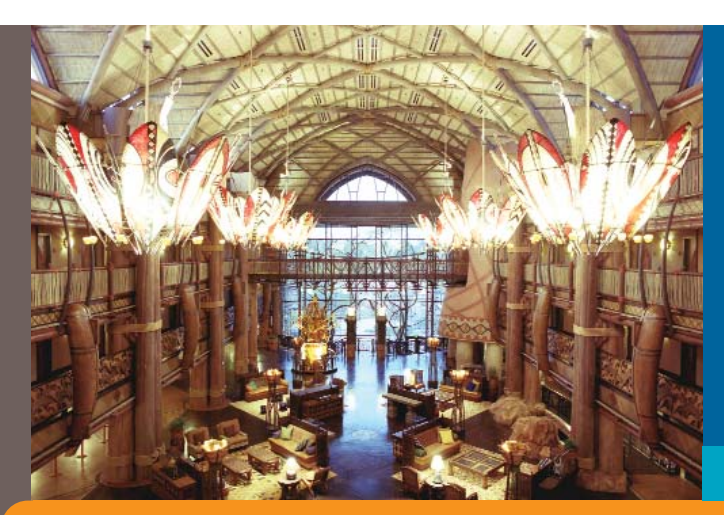
Animal Kingdom Lodge, Lake Buena Vista, FL