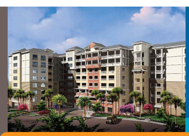
Bay Point Condominiums, Panama City, FL