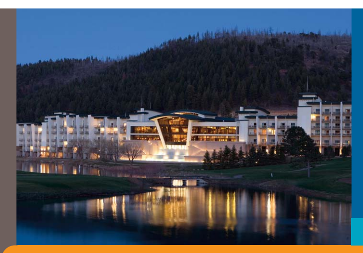
Inn of the Mountain Gods Resort and Convention Center, Mescalero, NM