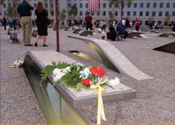
Pentagon Memorial, Arlington, VA