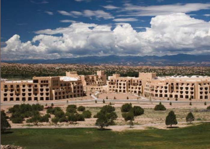
Buffalo Thunder Resort and Casino, Santa Fe, NM