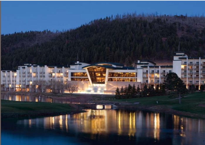
Inn of the Mountain Gods Resort and Convention Center, Mescalero, NM