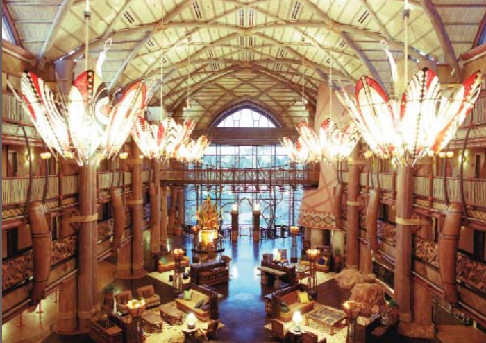
Animal Kingdom Lodge, Lake Buena Vista, FL