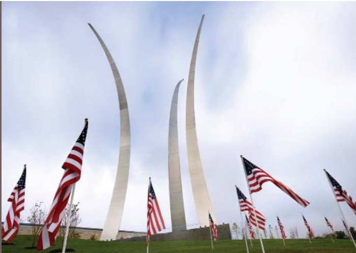
Air Force Memorial, Arlington, VA