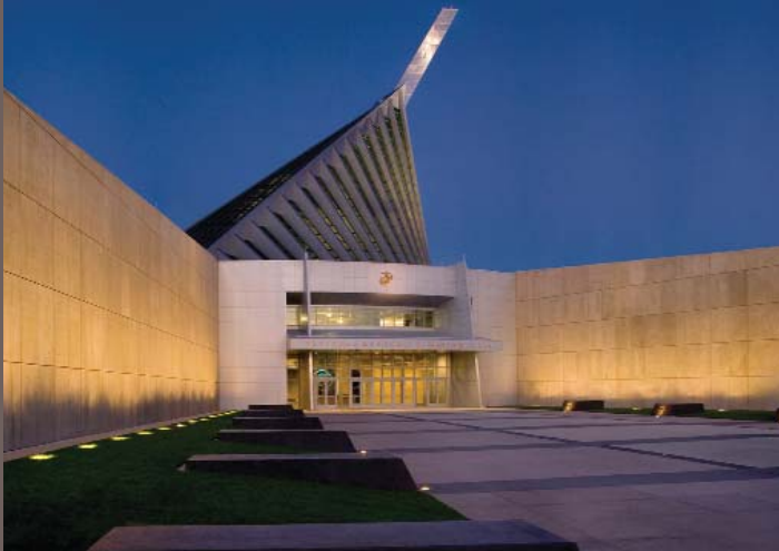
National Museum of the Marine Corps, Triangle, VA