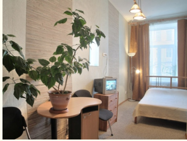
Our hostel. Double room

The school have the possibility to accommodate students in our shared flats as well as in the apartment for rent. All accommodations are located in the city-centre and not far from the school.