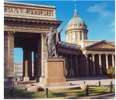
The Kazan Cathedral

Learn Russian at ProBa - near Nevsky Prospekt - it's meant to be in the focus of cultural life, business activities and public amusements of St. Petersburg.