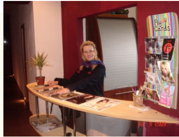
Our hostel. Reception.