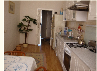
Our shared flat