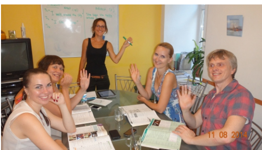
We offer courses in small group

During the course we offer rich cultural program including excursions and tours to other Russian cities. Some excursions are, so called, study excursions, when a guide uses “adapted” Russian to help the students not only get some extra vocabulary knowledge, but also to practice there conversational skills. These excursions are arranged in the way that even a beginner will not waste the time but enlarge his Russian vocabulary. Study excursions are the part of the educational program and usually are devoted to different topics covered in classrooms.