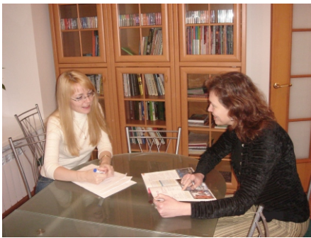
Our library, Individual Course

Studying in Russia is a life-altering experience. Living in a different culture will help you see the world from a completely different perspective. It is an amazing experience that will change your life.