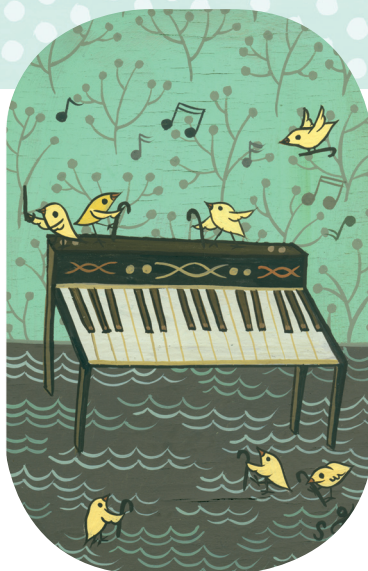
“Song and Dance” for Tiny Showcase print series