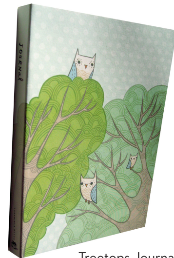
Treetops Journal for Chronicle Books