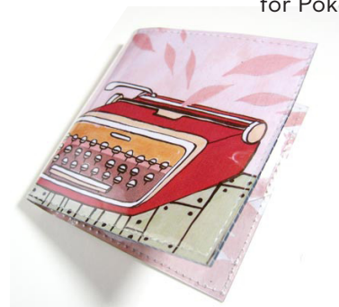
Typewriter wallet for Poketo