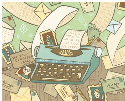
“Letters to the Editor” illustration for Chicago Magazine