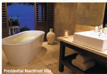
Presidential Beachfront Villa