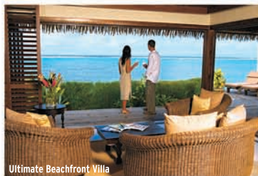
Ultimate Beachfront Villa