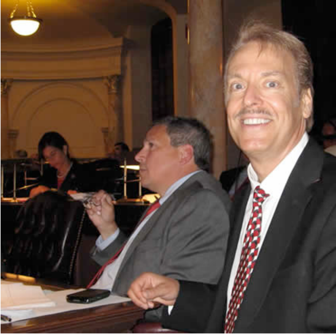
Figure 2 - New Jersey Senator Kip Bateman & Veny Musum, Chairman NEI Center