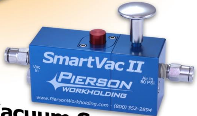
Vacuum Control Unit