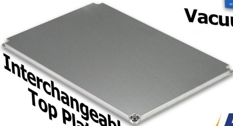
Interchangeable Top Plates