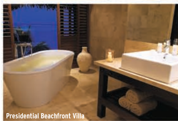
Presidential Beachfront Villa