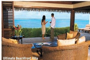
Ultimate Beachfront Villa