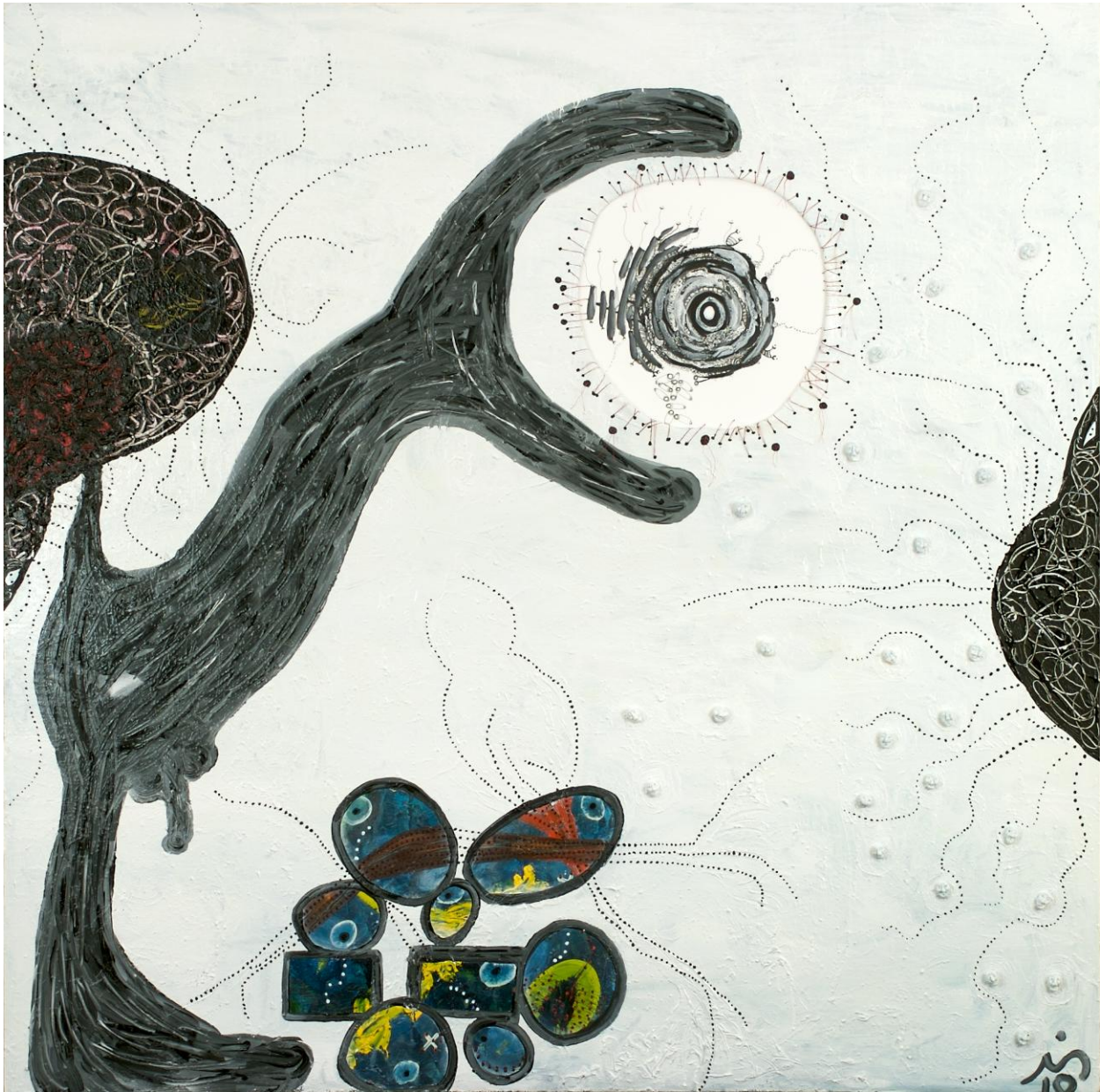
54"x54" Oil, Resin, Pigment, clay, string, pen & ink 2010