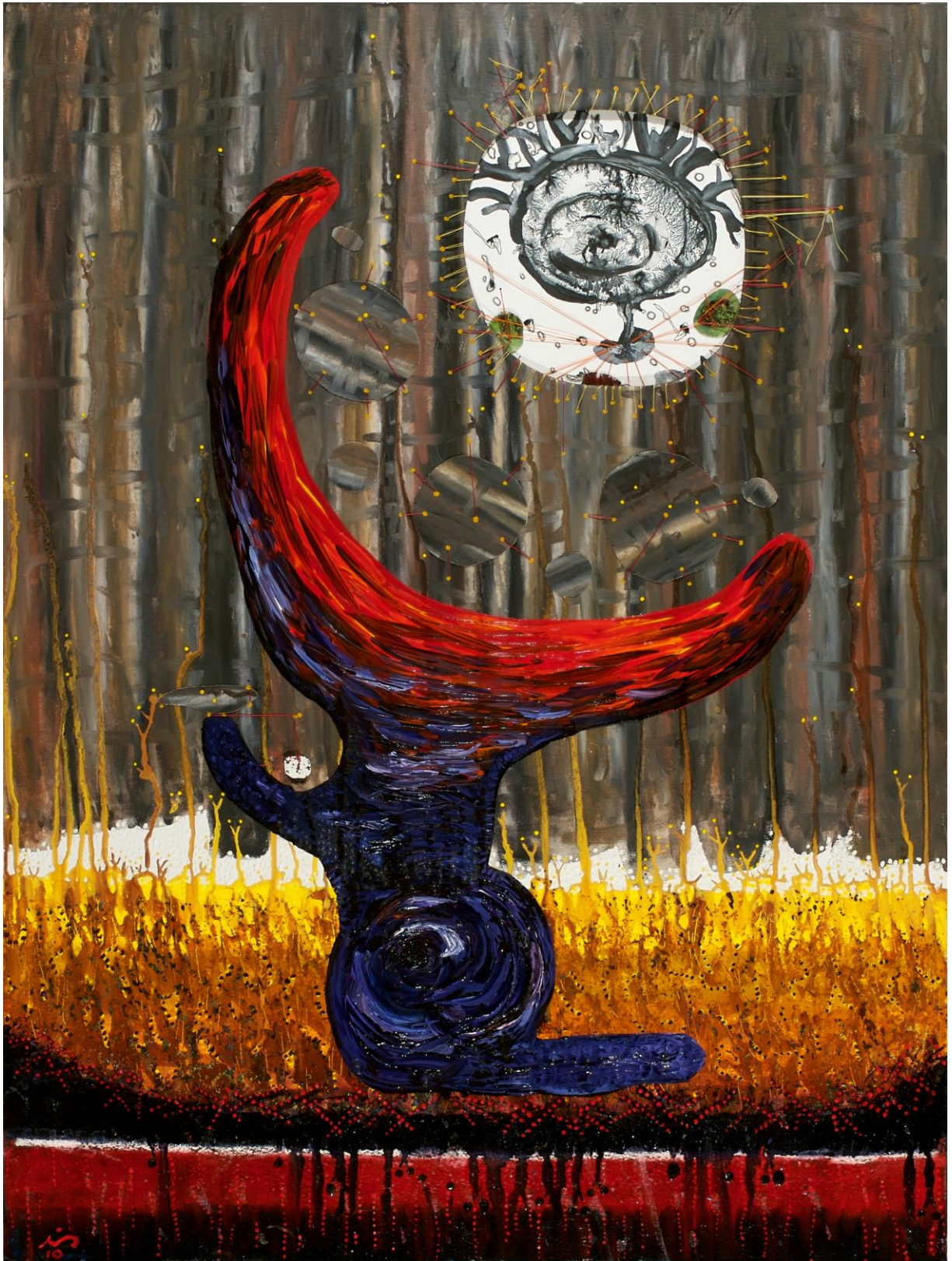
30"x40" Oil, Resin, Pigment, string, pen & ink 2010

Childhood Unmothered in one tangled beat