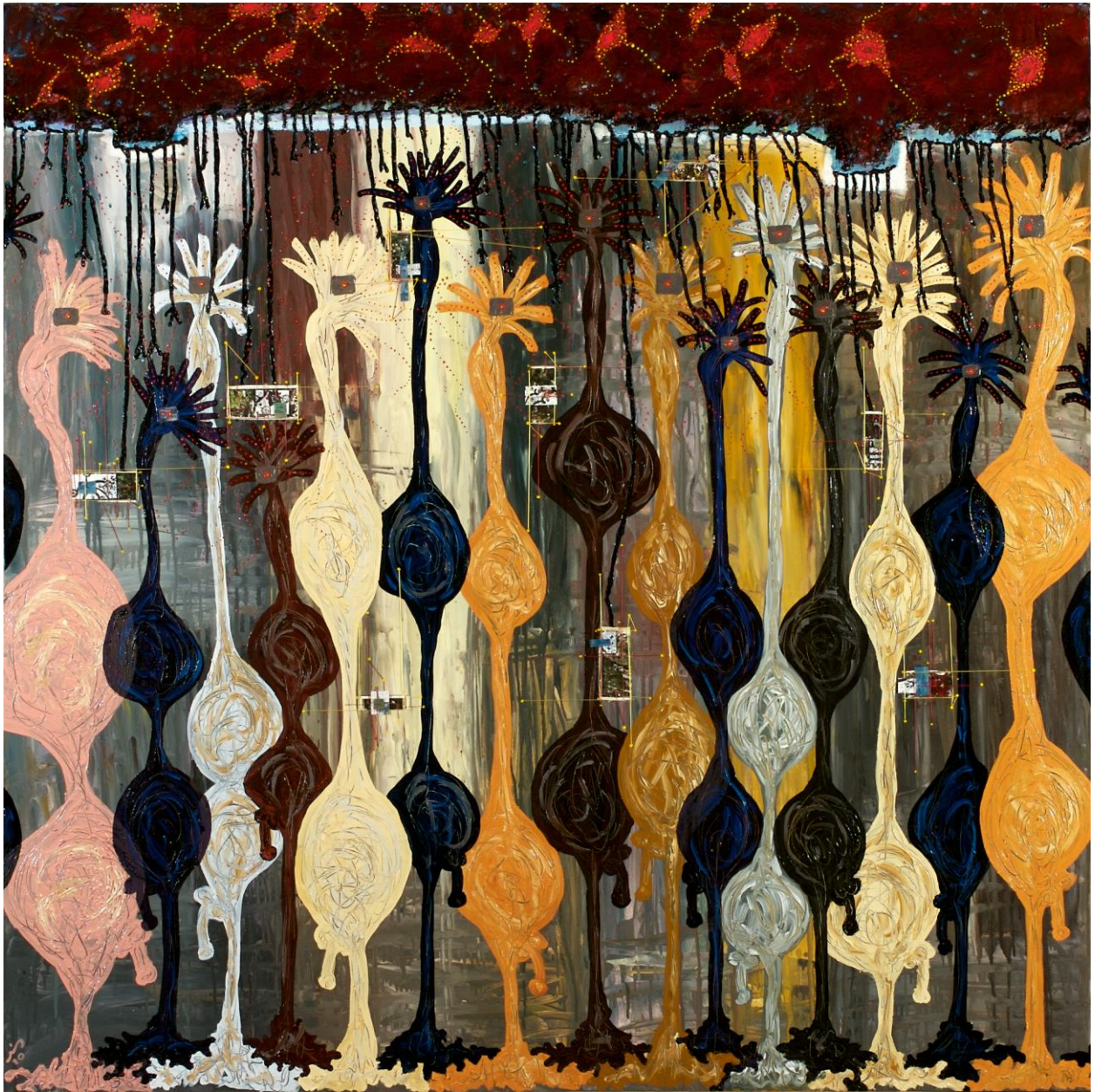
54"x54" Oil, Resin, Pigment, string, painted vellum 2010

Many Guys Loosely Thinking of Floating Thoughts