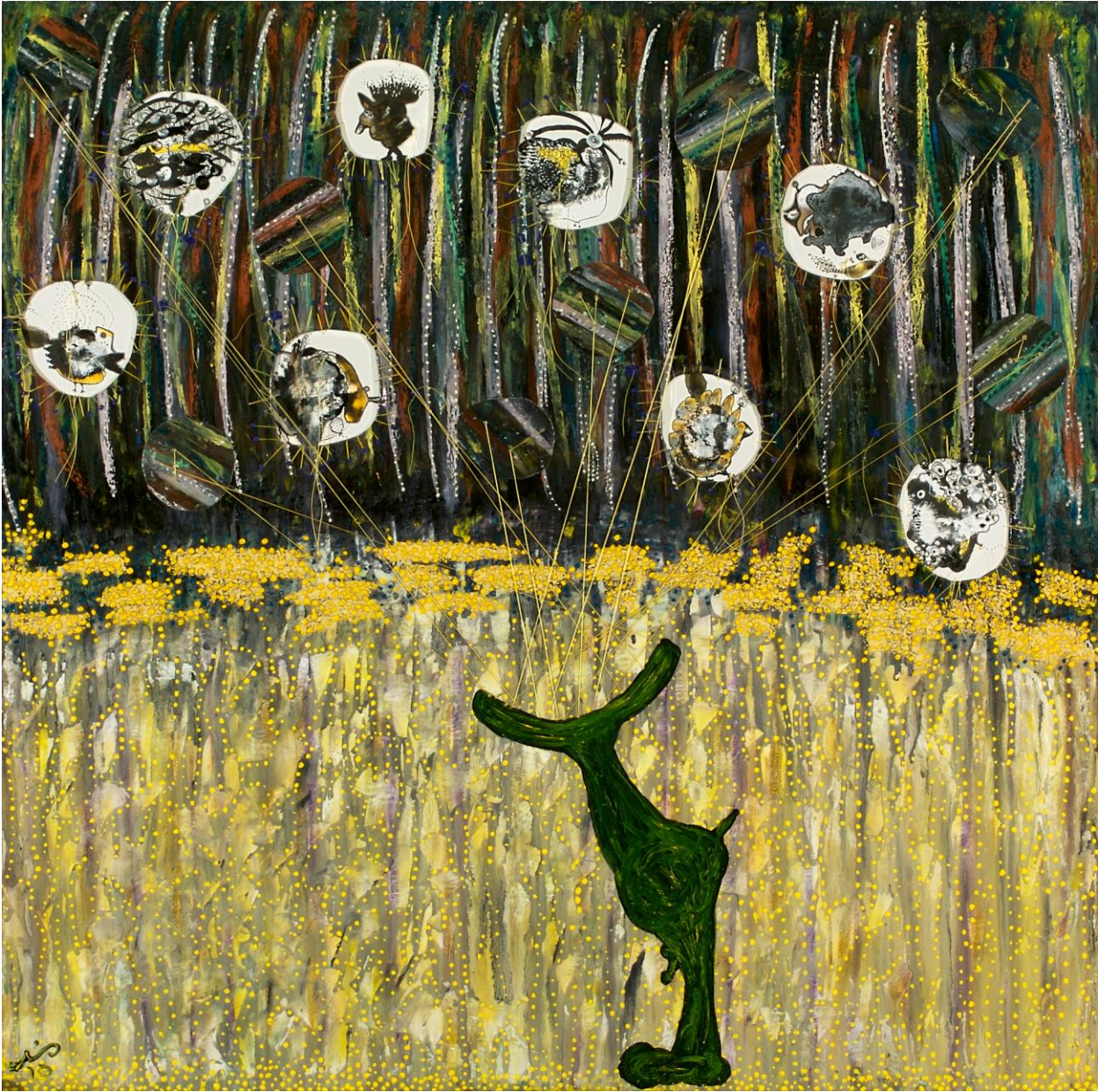
36"x36" Oil, Resin, Pigment, string, painted vellum 2010

ssssdssss as it swacked against the deviant Gyrus