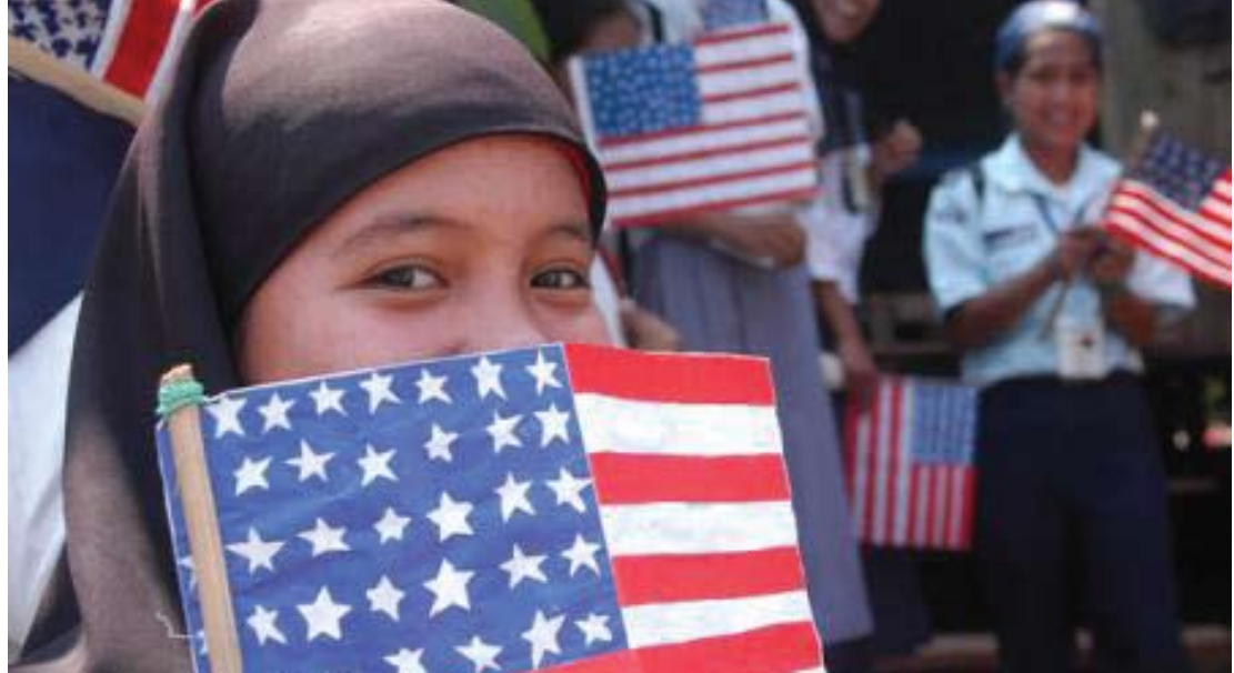
A young American Muslim girl holds the American flag.