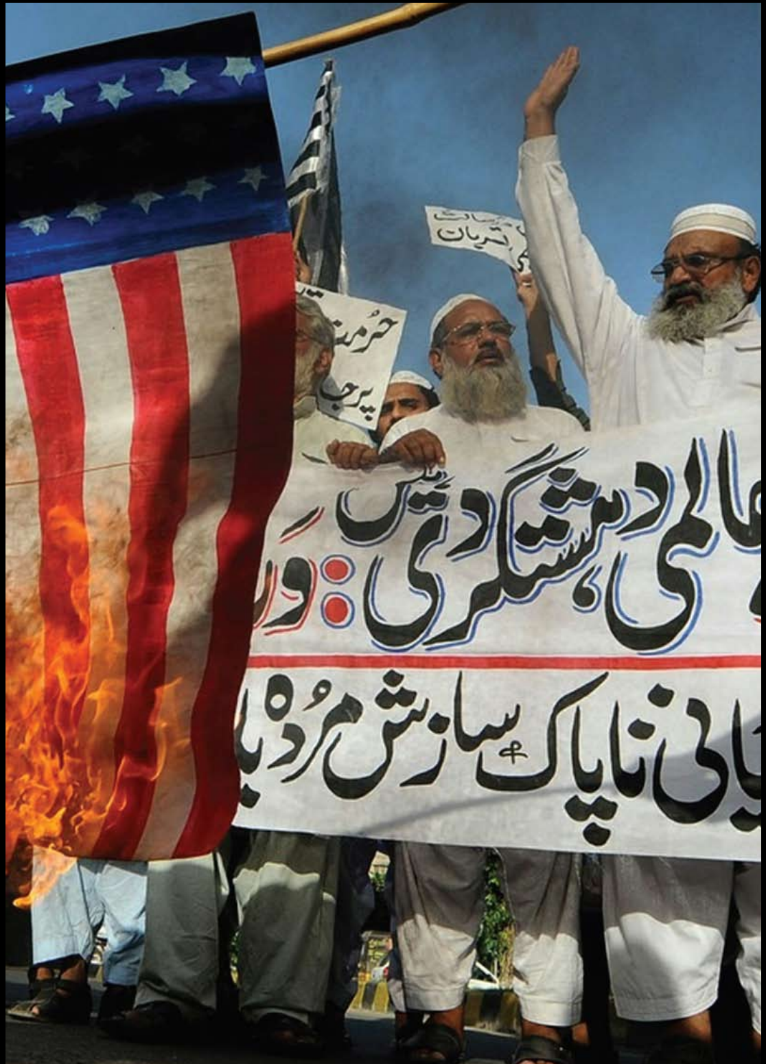
Pakistani Muslims burn a US Flag during a protest in Lahore on September 19, 2010, against earlier threats by US pastor Terry Jones to burn copies of the Muslim Holy book, the Koran.