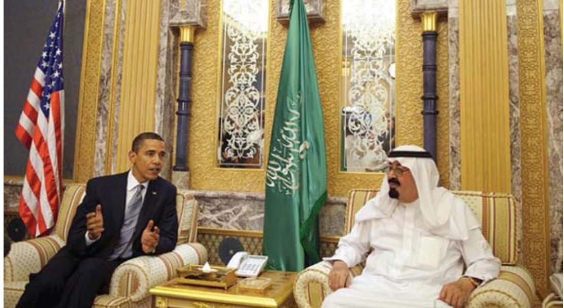
Obama with King Abdullah at the king's ranch in the outskirts of Riyadh.

What the United States does have the power to do is to make sure that it is not seen as an enemy of Islam itself. Rhetoric is crucial to this, but actions are even more important. The United States must, in other words, concern itself with what the Muslim world thinks of it because there is a correlation between that opinion and the size of the pool of radicals available for recruitment to terrorism.