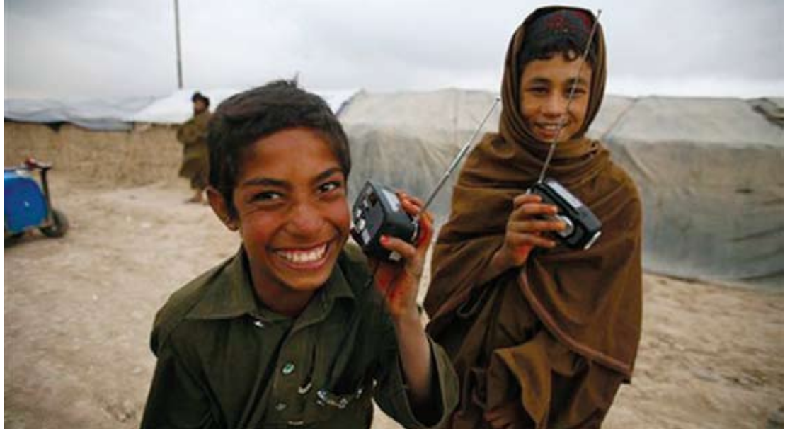
Internally displaced Afghan children listen to radios distributed by Radio Free Europe/ Radio Liberty in Kabul, Afghanistan.

should move away from advocating for elections and toward placing a far greater emphasis on democracy's associated values, starting with the freedom of speech and the plurality of opinion. This would be a way of fulfilling the promise of President Obama's inaugural address that "those who cling to power through corruption and deceit and the silencing of dissent" can be sure that America "will extend a hand if you are willing to unclench your fist." 18