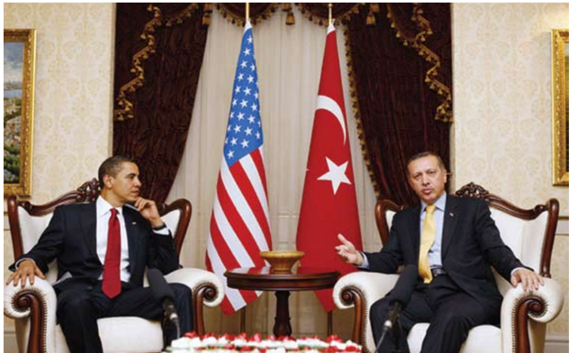
President Obama meets with Prime Minister Recep Tayyip Erdogan on his first visit to Turkey.

Ultimately, American foreign policy should aim toward a world in which improved understanding between the Muslim and non-Muslim worlds leads to good relations, improved trade, cultural relations, and travel. The Muslim world has a rich culture that can be explored, and both it and the US could be enriched by greater dialogue and understanding. But the longest journey begins with the first step, and the first step in this case is to prevent the Muslim world from becoming a threat to US security.