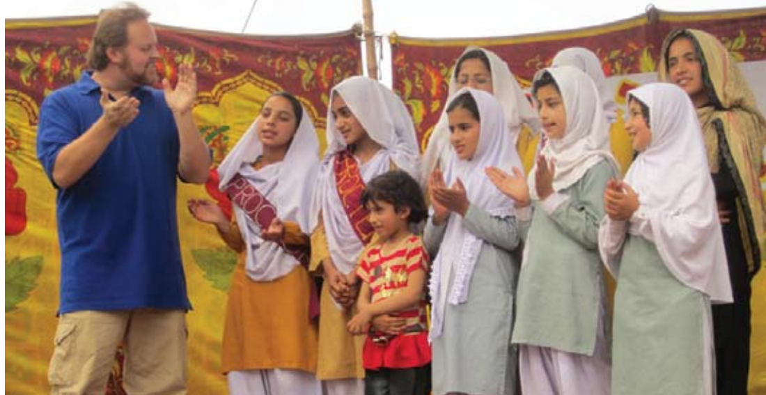
Instructors teaches Pakistani girls about music through The Pakistan America Peace Through Music Project.