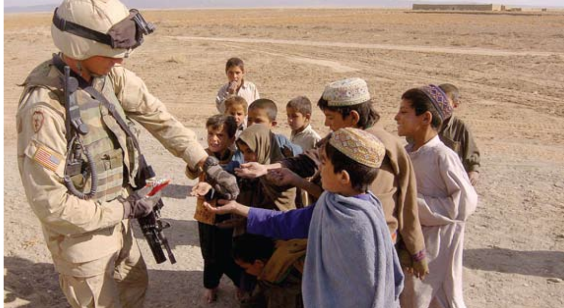
A Soldier from Co. C, 2nd Bn., 27th Inf. Rgt. hands out Skittles candy to Afghan children on Dec. 22 in Khezer Kheyl, Afghanistan.

A 2008 Gallup poll in ten predominantly Muslim countries 8 asked respondents to rate the importance of two specific policies – withdrawing troops from Iraq and closing Guantanamo Bay – and to rate actions relating to more general social improvements having to do with economic development, technology, poverty, and governance. Respondents were asked to rate these on a five-point scale, where 1 meant “not significant at all” and 5 meant “very significant.”