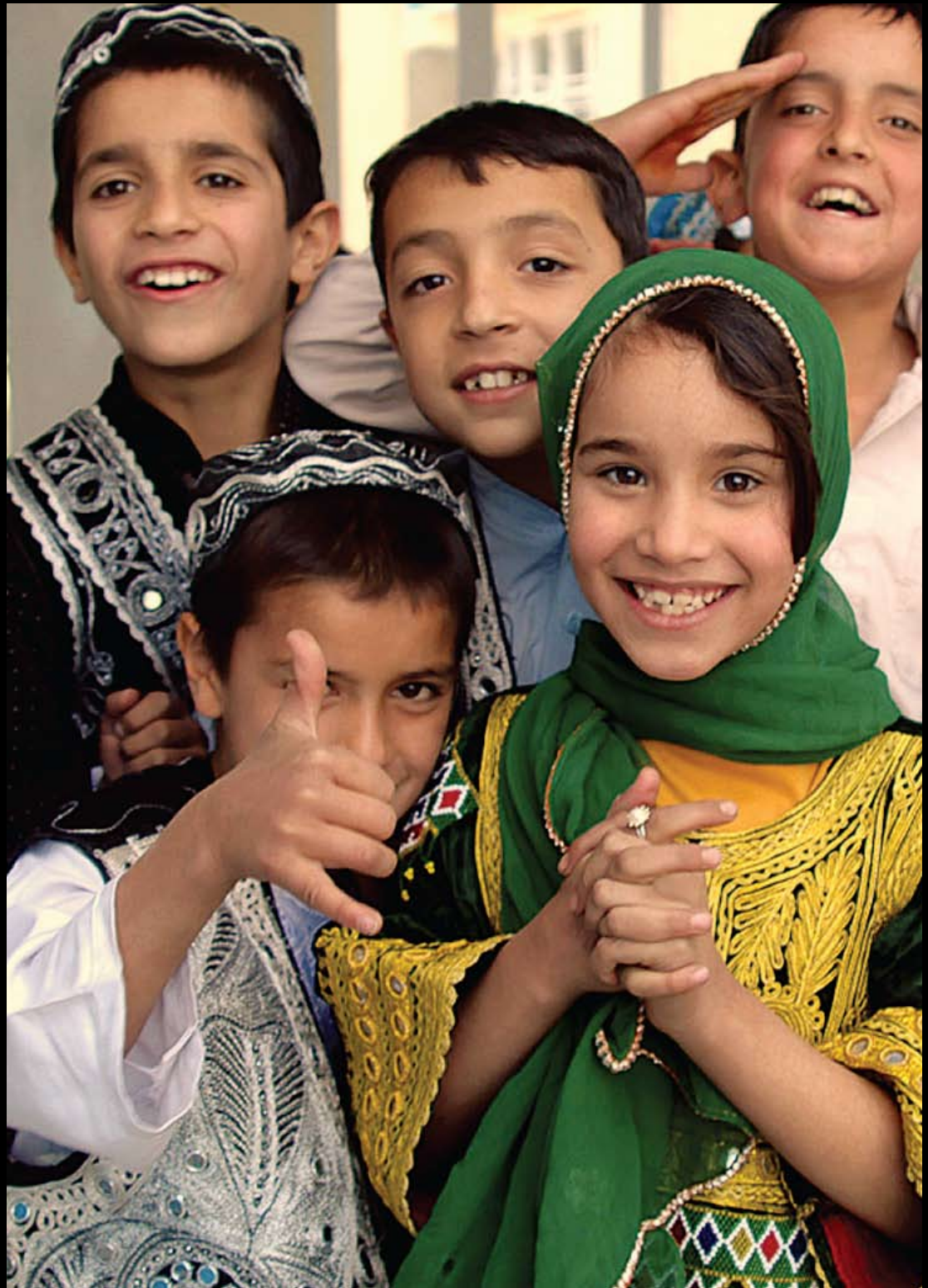
Afghan children gather in front of their newly built school.