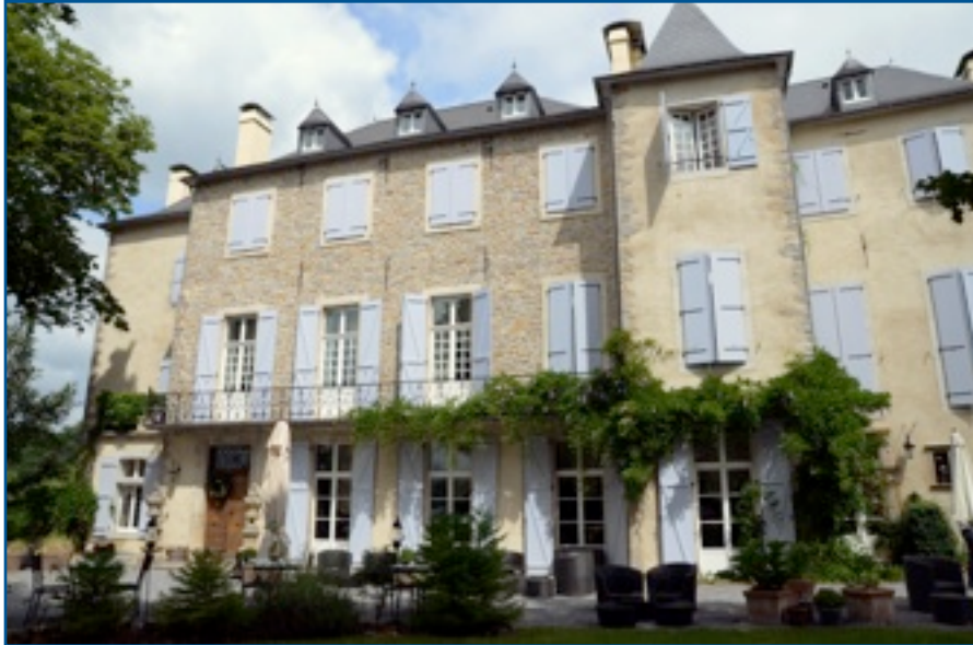
The Château de Lamothe in the village of Moumour (Béarn)