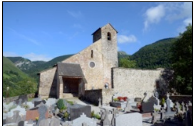
The historic 11th century Romanesque church of Sainte-Engrâce