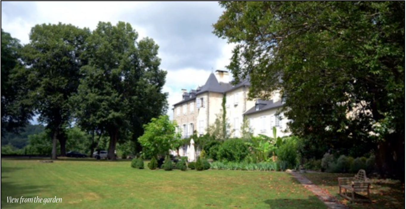
View from the garden

In addition to the five elegant chateau bedrooms, the property also offers an annex with first floor gîte, or private apartment (sleeping six), for families or friends that can be rented on a weekly basis.