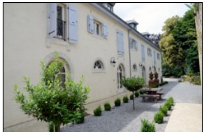
The annex building: gym, art studio, apartment and conference center

And just a short drive away one can enjoy wine tasting, visit the cathedral and Friday morning market in Oloron or attend its July jazz festival, tour Henri IV's castle in Pau, play golf, go rafting, fish for salmon, take in a thermal bath or explore the stunning nature that surrounds the property.