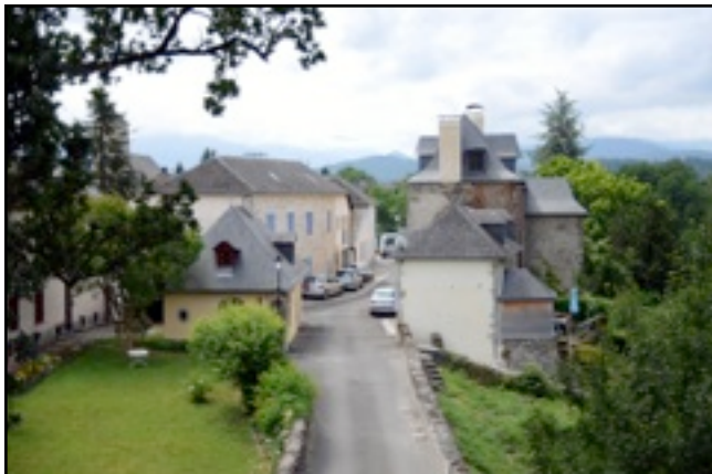
The village of Moumour as seen from the Château's annex

We found the Château de Lamothe to be a simply delightful country base, a perfect hideaway spot to unwind, sunbathe, have a massage, enjoy a book from the library, write, draw, paint or simply commune with nature and soak up the estate's captivating views.