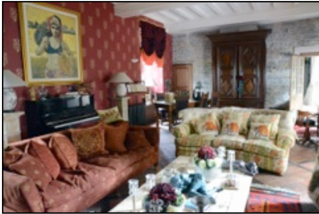
The main living room of the chateau