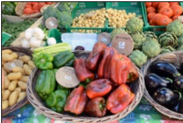
"Farm to Table" from the market in St-Jean-de-Luz