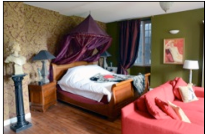
One of the guest bedrooms in Château de Lamothe

And just a short drive away one can enjoy wine tasting, visit the cathedral and Friday morning market in Oloron or attend its July jazz festival, tour Henri IV's castle in Pau, play golf, go rafting, fish for salmon, take in a thermal bath or explore the stunning nature that surrounds the property.