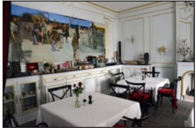
Château de Lamothe's elegant dining room on the main floor

We found the Château de Lamothe to be a simply delightful country base, a perfect hideaway spot to unwind, sunbathe, have a massage, enjoy a book from the library, write, draw, paint or simply commune with nature and soak up the estate's captivating views.