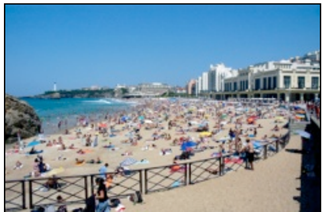
On the beach at Biarritz