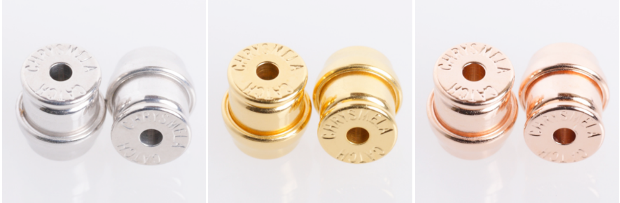
Close up of the lightweight Chrysmela Catch™ earring backs.