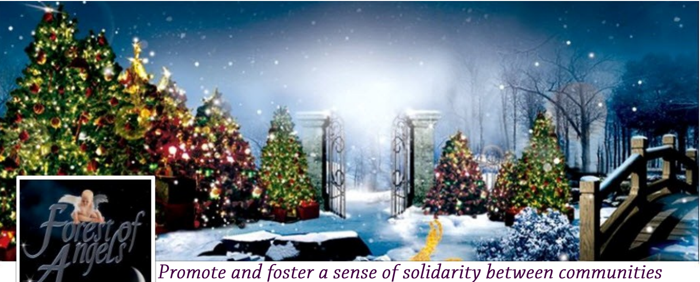
Promote and foster a sense of solidarity between communities and businesses and community involvement.