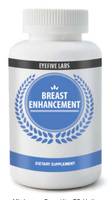
Minimum Quantity 72 Units