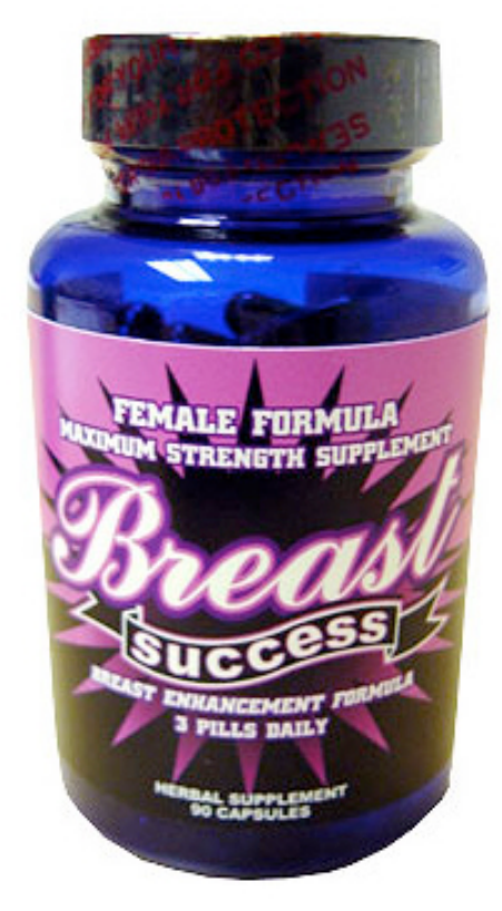
Minimum Quantity 72 Units