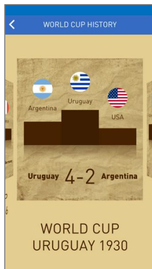
World Cup History