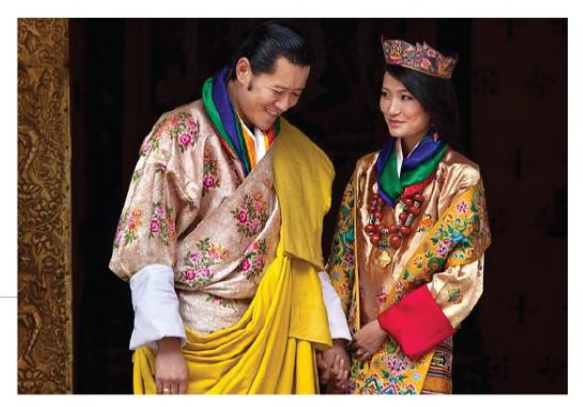
The King and Queen of Bhutan, 2012