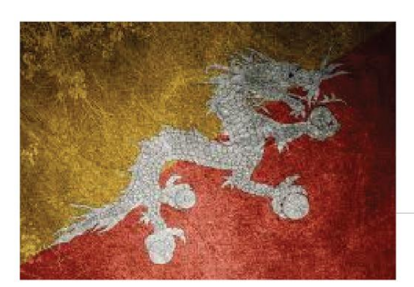
The national flag of Bhutan