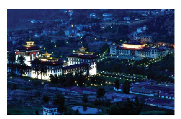
Thimphu, the capital of Bhutan at night