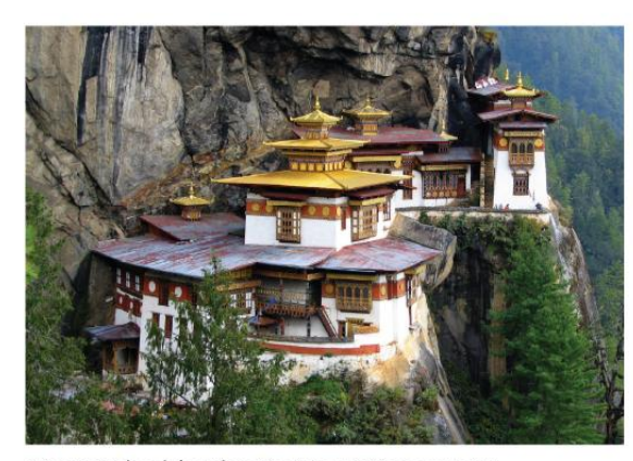
Mountainside Tiger's Nest Monastery