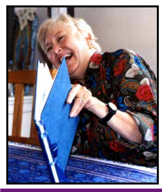
Keep the stories and love alive! www.SimplyCelebrate.net/Mad-Moon

We do all the work, you get all the credit, and your loved one receives a book full of love and laughter that will last a lifetime.