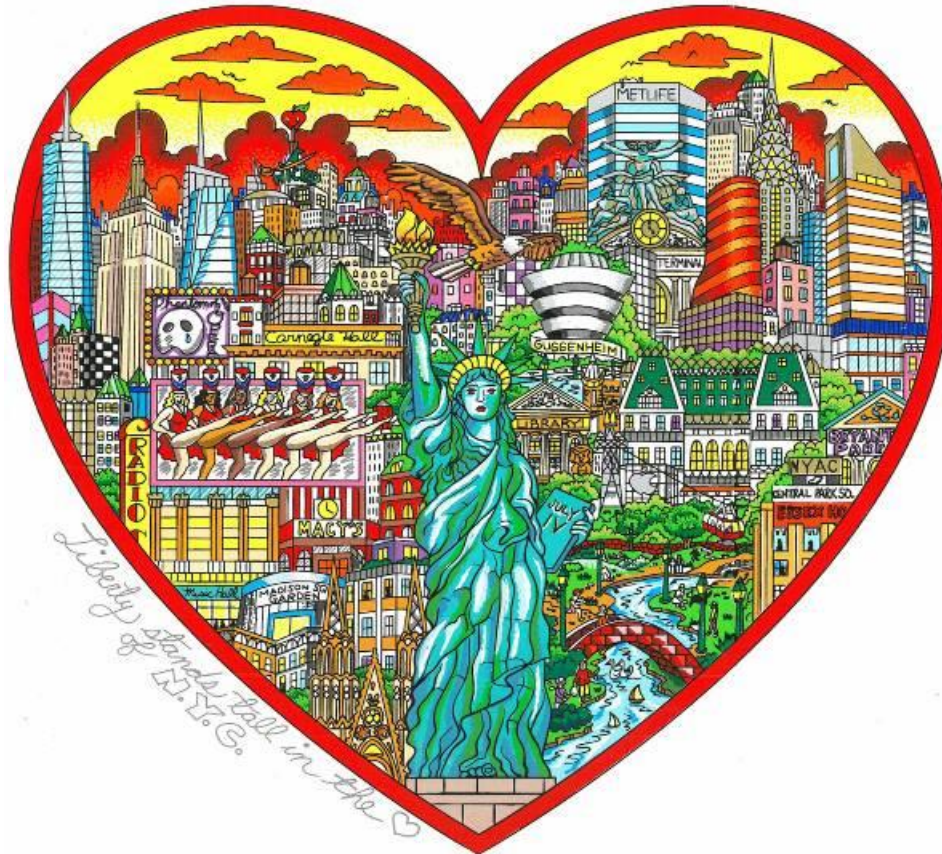
Liberty Stands Tall in the Heart of the Big Apple