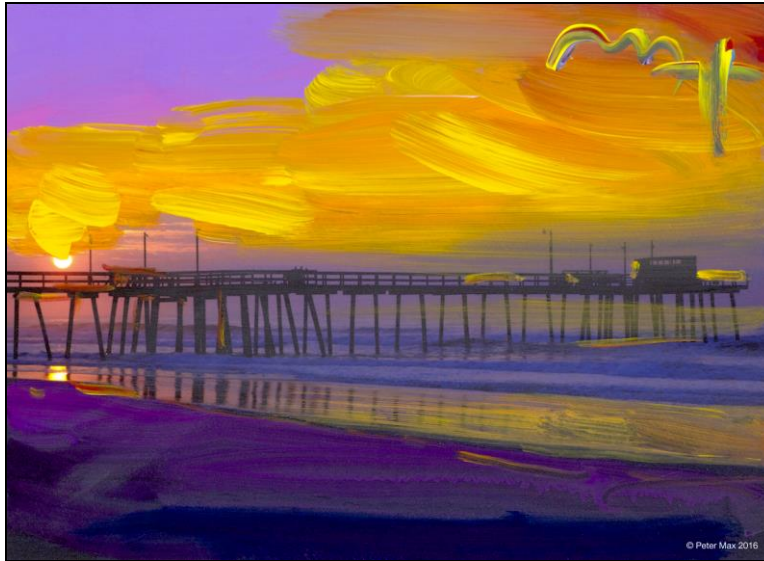
Ocean Series III , Copyright Peter Max 2016