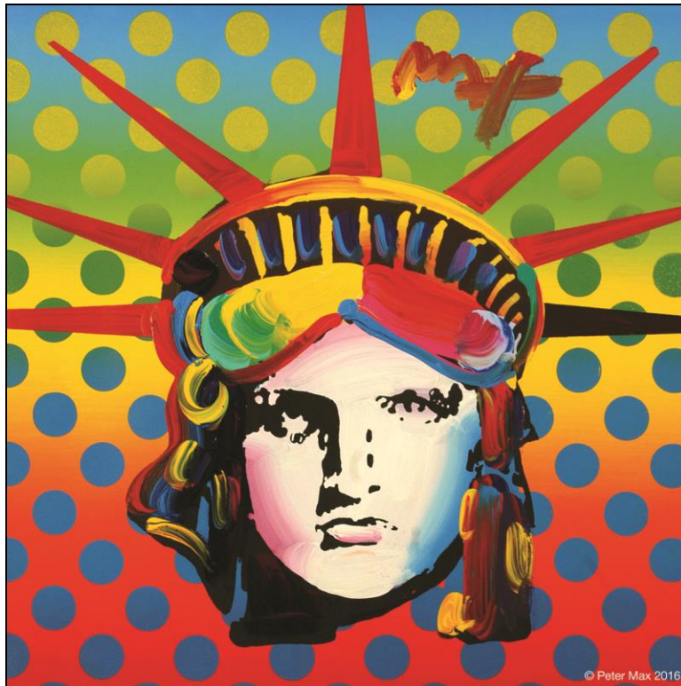
Liberty Head

Peter Max is revered for his celebrity commissions and portraits. His portraits have honored many of the most prominent personalities of our era, including six U.S. presidents, The Dalai Lama, Martin Luther King, Jr., The Pope , and many other celebrities, as well as rock and jazz musicians. Last year, Peter Max turned the talented coaches of ‘The Voice,’ into a work of art for NBC’s print, digital and outdoor