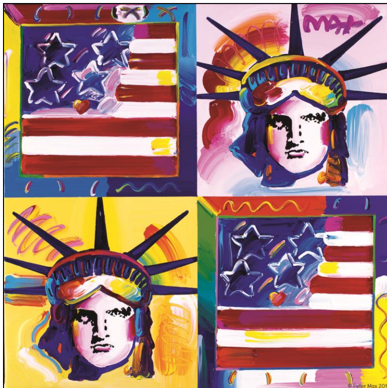
Flags & Liberty Heads, Copyright Peter Max 2016

“Peter Max Celebrates America the Beautiful” opens Friday, July 1 and runs through Monday, July 4, 2016 from 10:00 AM to 10:00 PM daily, with all artwork on display available for acquisition. Guests will have the opportunity to meet Peter Max when he signs purchased artwork from 7:00 PM until 10:00 PM on Saturday, July 2 and from 1:00 PM until 4:00 PM on Sunday, July 3.