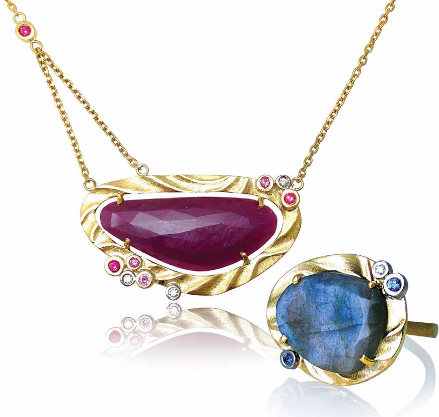
Red island pendant - 18k yellow gold, ruby, pink sapphires, diamonds. Ocean dream ring - 14k yellow gold, labradorite, blue sapphires, diamond.