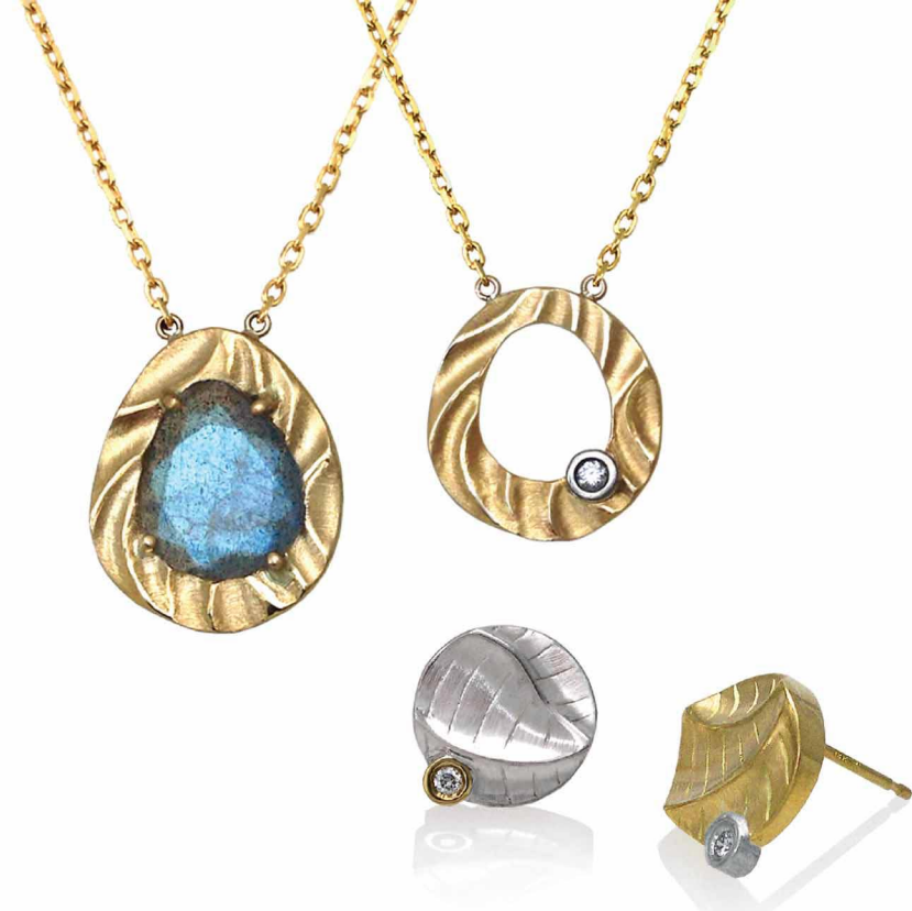
Pebble pendants - 14k yellow gold, labradorite, diamond. Round studs - 18k yellow gold, sterling silver, diamonds.