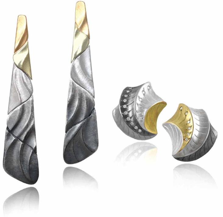
Ombre earrings - 18k yellow gold, 14k green gold, sterling silver, oxidized silver. Sea shell earrings - 18k yellow gold, sterling silver, oxidized silver, diamonds.