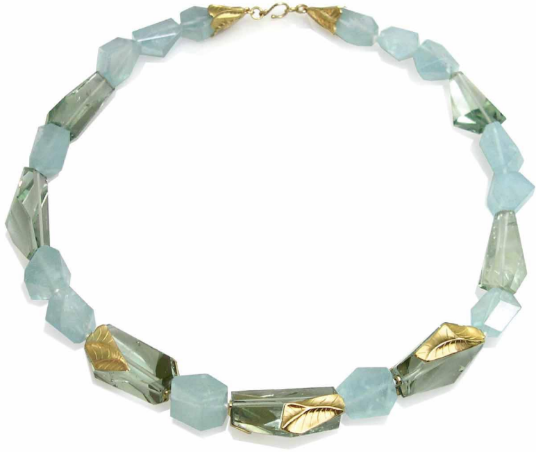
Seafoam necklace - 18k yellow gold, aquamarine, green quartz.