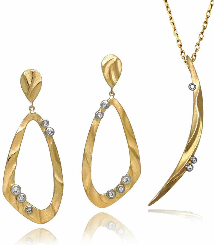
Open pebble earrings - 18k yellow gold, 18k white gold, diamonds. Crescent pendant - 18k yellow gold, 18k white gold, diamonds.