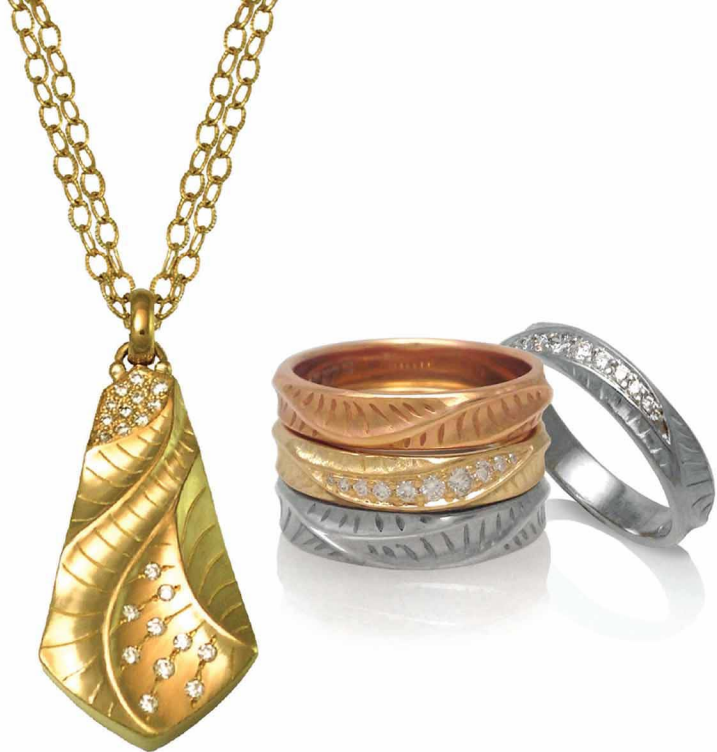
Kite shape pendant - 18k yellow gold, diamonds. Stackable rings - 18k yellow, rose and white gold, diamonds.