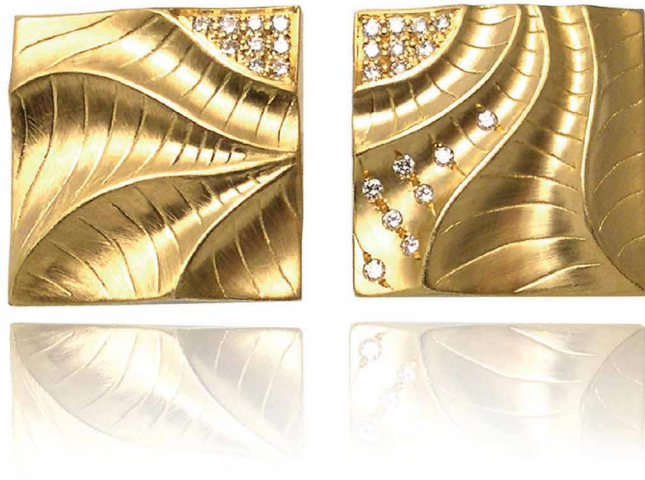
Square puzzle earrings - 18k yellow gold, diamonds.