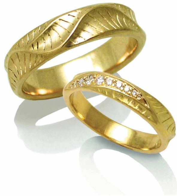
Wedding bands - 18k yellow gold, diamonds.