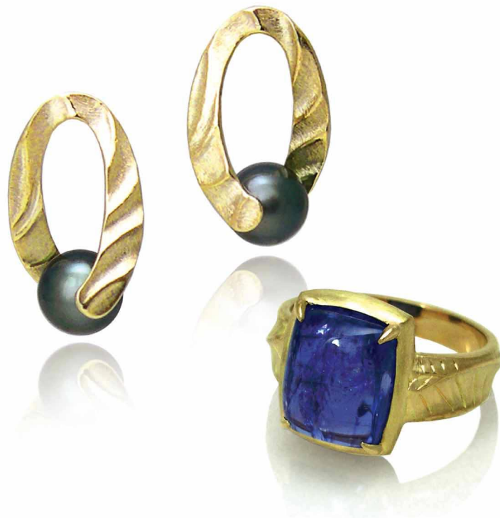
Holding you earrings - 18k yellow gold, tahitian pearls. Iris ring - 18k yellow gold, tanzanite.