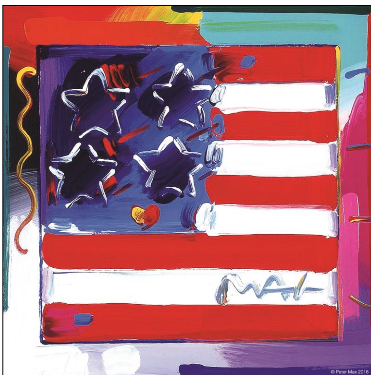
Flag with Heart

“Peter Max Celebrates America the Beautiful” opens Friday, July 1 and runs through Monday, July 4, 2016 from 10:00 AM to 10:00 PM daily, with all artwork on display available for acquisition. Guests can meet the iconic Peter Max in the gallery when he signs purchased artwork at two receptions: 7:00 PM until 10:00 PM on Saturday, July 2 and 1:00 PM until 4:00 PM on Sunday, July 3.