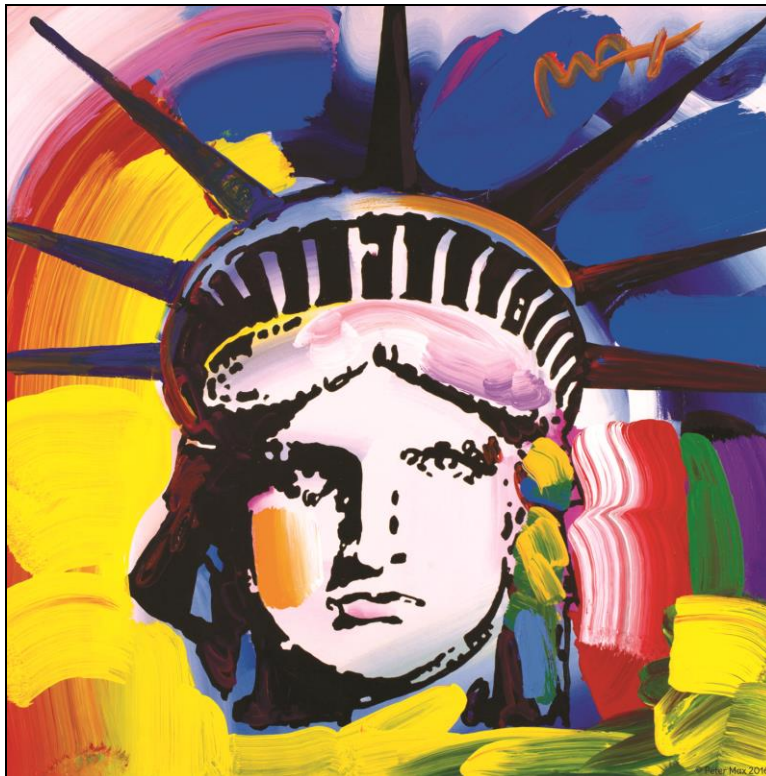
Liberty 2000

Peter Max, whose bold colors and uplifting images are instantly recognizable and admired worldwide, has had a love affair with America since he arrived in the country as a young boy from China. Beginning with the U.S. Bicentennial celebration in 1976, Peter Max has created unique paintings of the Statue of Liberty each Fourth of July to celebrate the patriotic symbol of the freedom and independence that Americans enjoy. Over the years, he has celebrated Independence Day with world leaders ranging from The King of Sweden, President Ford, and incoming President Jimmy Carter in 1976; to President Ronald Reagan and Nancy Reagan in 1981; and President Bill Clinton in 2000.