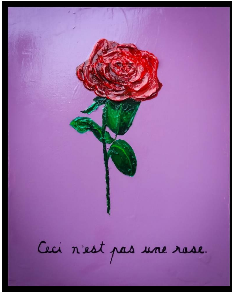
This is Not a Rose

In addition to an extraordinary collection of artwork and custom-framing, Ocean Galleries also offers a variety of hand-made crafts from local, regional, and national artists in America, such as glass, pottery, jewelry, and furniture. All summer exhibitions take place at the Stone Harbor location of Ocean Galleries (9618 Third Avenue), which is open from 10:00 AM until 10:00 PM daily throughout the summer. The Avalon, NJ location of Ocean Galleries (2199 Ocean Drive) is open daily from 9:00 AM until 5:00 PM. For more information or directions, call 609-368-7777 or visit www.oceangalleries.com