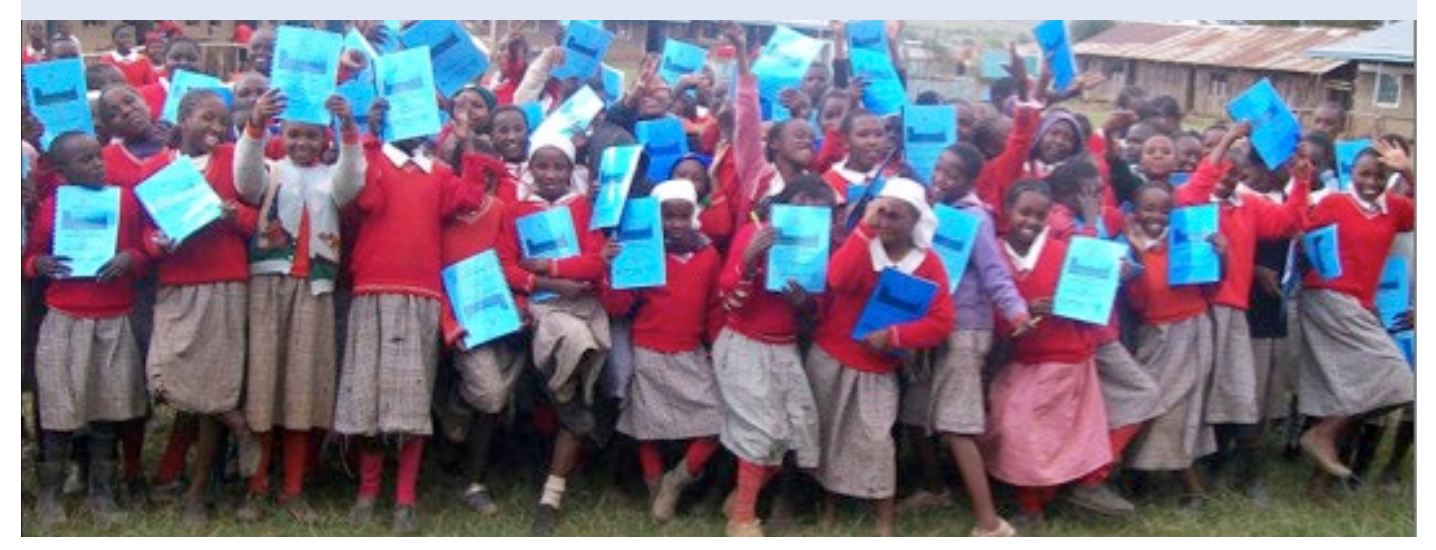
Primary-aged girls participating in the Wezesha Vijana project.

percent of school-aged girls in Kenya drop out because of pregnancy (Girls Discovered n.d.).