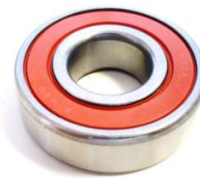
Seginus replacement Ball Bearing P/N 300SGL1052-1EH