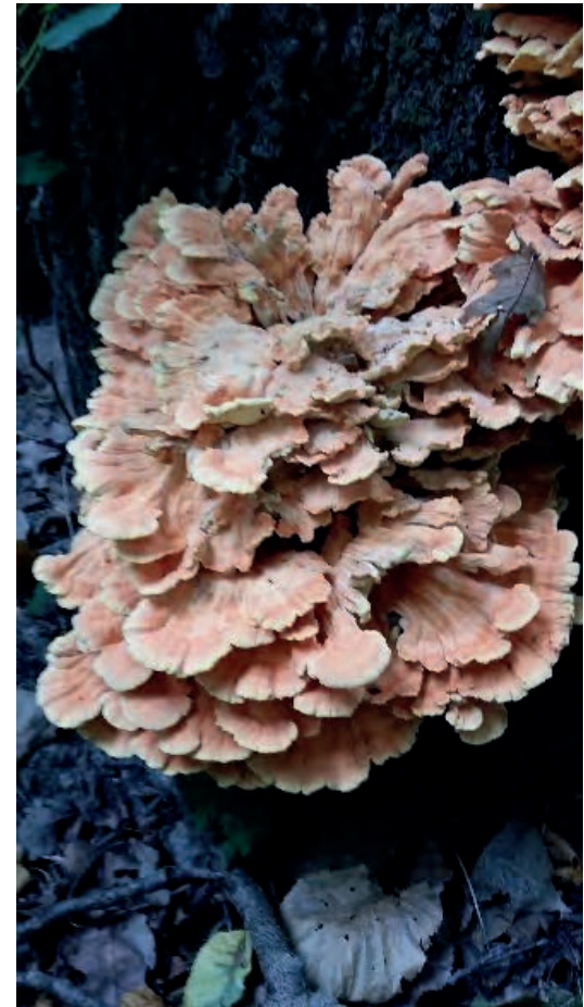
One Mushroom value $500

See Links to full Fish & Wildlife Conservation and Forest Plan