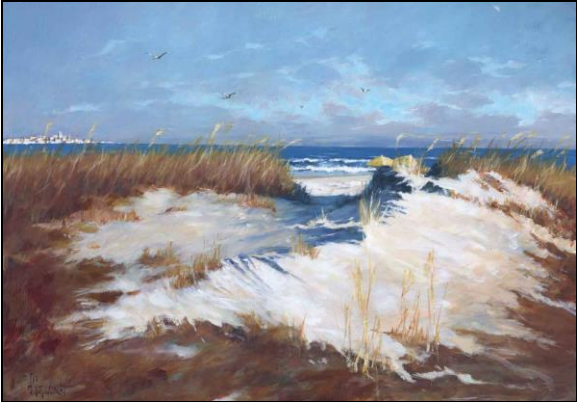
“Southern Spain” Copyright ©Aldo Luongo 2017 All Rights Reserved

RECEPTIONS WITH THE ARTIST Saturday, July 22, 2017 7:00 PM to 10:00 PM Sunday, July 23, 2017 1:00 PM to 4:00 PM