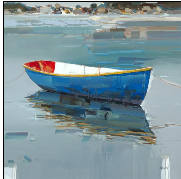
“Soothing Moments” Copyright ©Josef Kote 2017 All Rights Reserved

Saturday, May 27, 2017 7:00 PM to 10:00 PM Sunday, May 28, 2017 7:00 PM to 10:00 PM