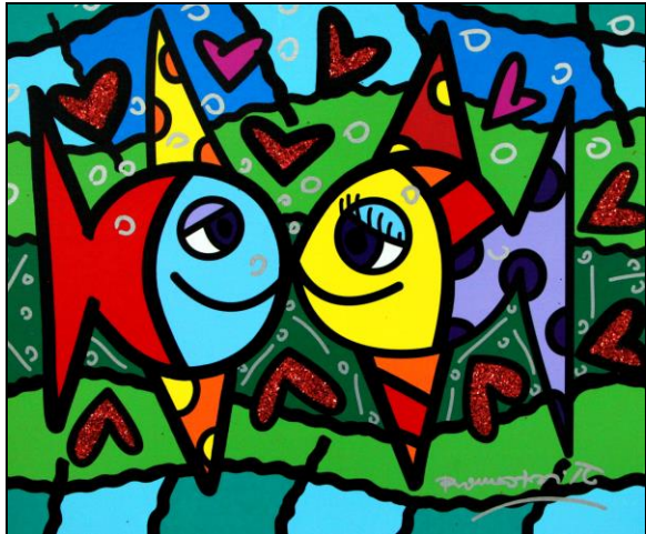
“Love You” Copyright ©Romero Britto 2017

RECEPTIONS WITH THE ARTIST Saturday, August 5, 2017 7:00 PM to 10:00 PM Sunday, August 6, 2017 1:00 PM to 4:00 PM