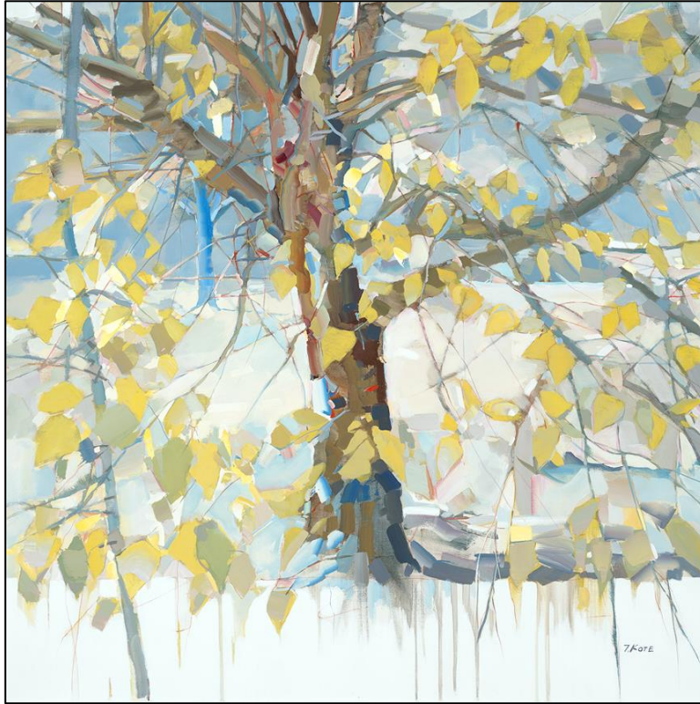
Morning Spring