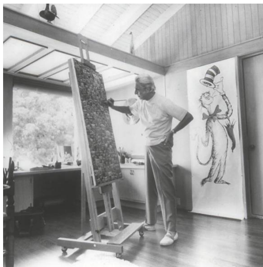
Theodor Seuss Geisel

Join us for a fascinating look at the art and life of Theodor Seuss Geisel!