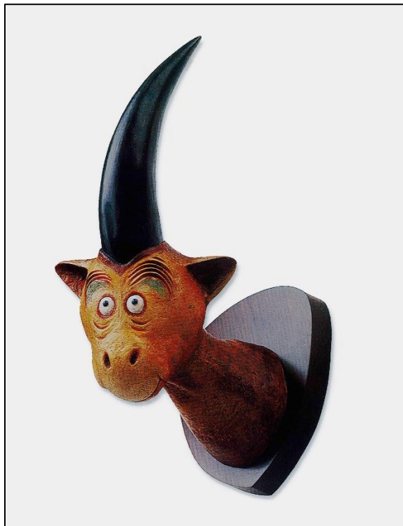
Mulberry Street Unicorn