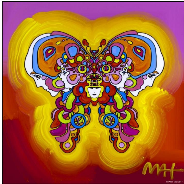
Butterfly, Copyright Peter Max 2017

Throughout his incredible artistic career, Peter Max has been the official artist for many national and international events, has painted presidents, world leaders and rock stars, and has created artwork on everything from a Boeing 777 to a 600-foot Woodstock stage. Peter has been the official artist of the GRAMMYs six times, and his recent works feature celebrity portraits of legendary musicians Tom Petty, Lionel Ritchie, Bono, and Bruce Springsteen, each of whom have been honored as The GRAMMYs MusiCares person of the year.