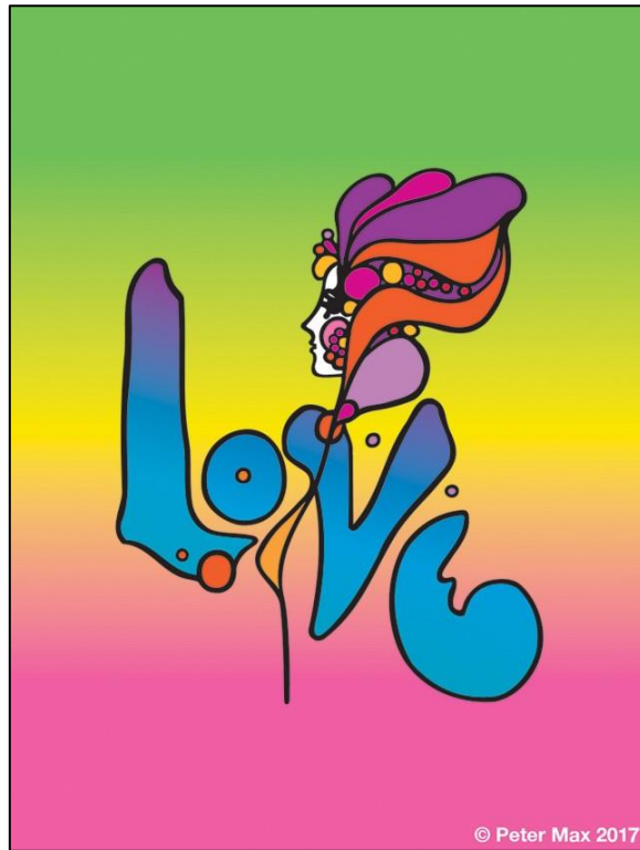
Love, Copyright Peter Max 2017

Along with the collection of his famous cosmic images celebrating the “Summer of Love,” this year’s exhibition will include numerous paintings created specifically for the Stone Harbor event.