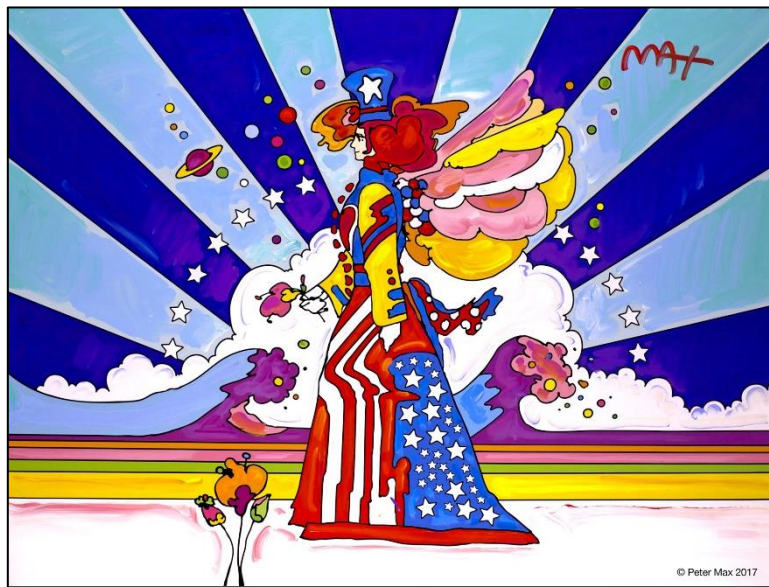
Cosmic Series – Angel, Copyright Peter Max 2017

"Peter Max – Summer of Love 50 th Anniversary" opens at Ocean Galleries (9618 Third Avenue, Stone Harbor/609.368.7777) on Friday, June 30 and is on display through Wednesday, July 5 with all artwork available for acquisition. Exhibit hours are 10:00 AM to 10:00 PM daily.