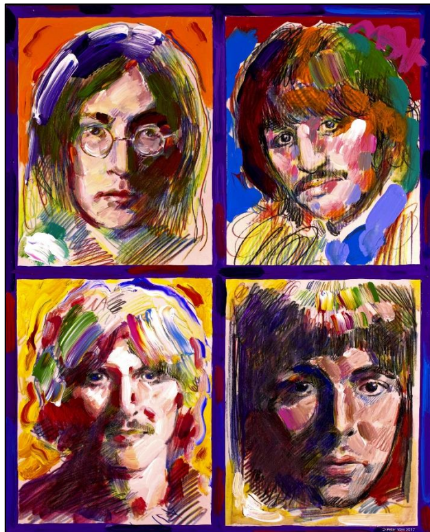
The Beatles

Throughout his incredible artistic career, Peter Max has been the official artist for many national and international events, has painted presidents, world leaders and rock stars, and has created artwork on everything from a Boeing 777 to a 600-foot Woodstock stage. Peter has been the official artist of the GRAMMYs six times, and his recent works feature celebrity portraits of legendary musicians Tom Petty, Lionel Ritchie, Bono, and Bruce Springsteen, each of whom have been honored as The GRAMMYs MusiCares person of the year.