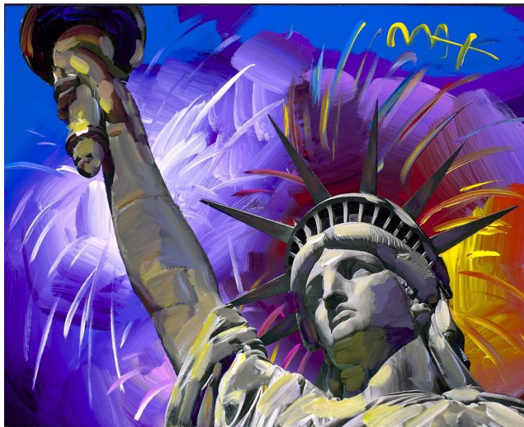
Statue of Liberty Fireworks

For the past five decades, Peter Max's art has been part of the fabric of American pop culture - from his numerous museum and gallery exhibitions to a giant Moscow Music Peace Festival stage, a six-hundred-foot-long Woodstock '99 Music Festival stage, a two-hundred-fifty-foot-long billboard flanking the U.S. Pavilion at the World's Fair in Seville, Spain, the hull of a giant Norwegian Lines cruise ship, and Dale Earnhardt's NASCAR race car. Max has been official artist for six GRAMMY Awards, five Super Bowls, the NHL All-Star Game, the 2000 World Series, the 2000 Kentucky Derby, the U.S. Winter Olympics, World Cup USA, the Indy 500, the Rock & Roll Hall of Fame, and many other notable events in sports and music. Max's portraits have honored U.S. Presidents, foreign dignitaries, rock stars and jazz musicians, movie stars and sports icons.