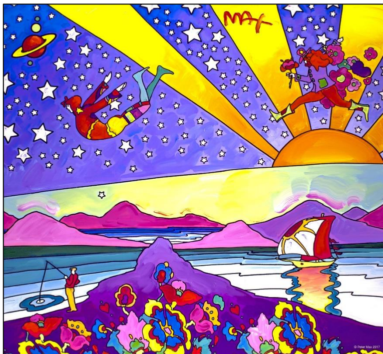
Make Every Day Earth Day, Copyright Peter Max 2017

Gallery-goers will have the chance to mingle with Peter Max 7:00 to 9:00 PM on Saturday, July 1 and Sunday, July 2, 2017 as he signs purchased artwork.