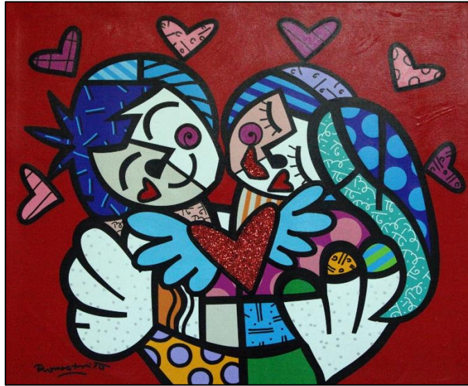
Hugs and Kisses, Copyright Romero Britto 2017

In February 2017, he worked with Corus Entertainment's Nelvana, Grey Matter, and United Talent Agency on a new television series for preschoolers called "Happy Art Happy Life," which was inspired by his amazing artwork. The show mixes action, animation, and remote videos to introduce the world of visual arts, following "Romero," a sharp-dressed bulldog who lives, paints, and sculpt in an exotic studio.