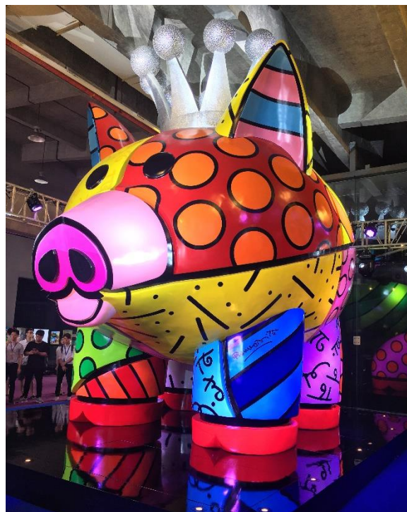
30' Pig Commission, Copyright Romero Britto 2017

Adored worldwide, the artist was recently commissioned by the owner of Net Dragon , an online gaming business, to create a pig, an historic Chinese symbol of bravery. In June, Britto flew to China to celebrate the installation of the 30-foot-high sculpture, the largest sculpture he has created to date.