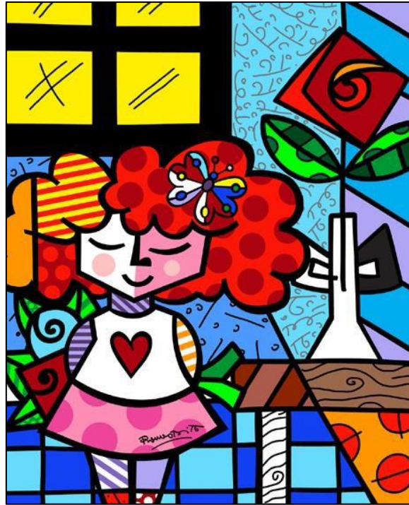
Good Girl, Copyright Romero Britto 2017

During his visit to South Jersey, Britto has committed to helping support a local charity that is particularly important to the gallery owners, the Helen L. Diller Vacation Home for Blind Children in Avalon, NJ. Britto will be donating one of his iconic paintings for the organization's fall fundraiser, Barefoot Ball, taking place on September 9, 2017 at the Windrift Hotel. The Britto painting, which will be custom framed by Ocean Galleries, will be part of the Live Auction during the fundraising event.