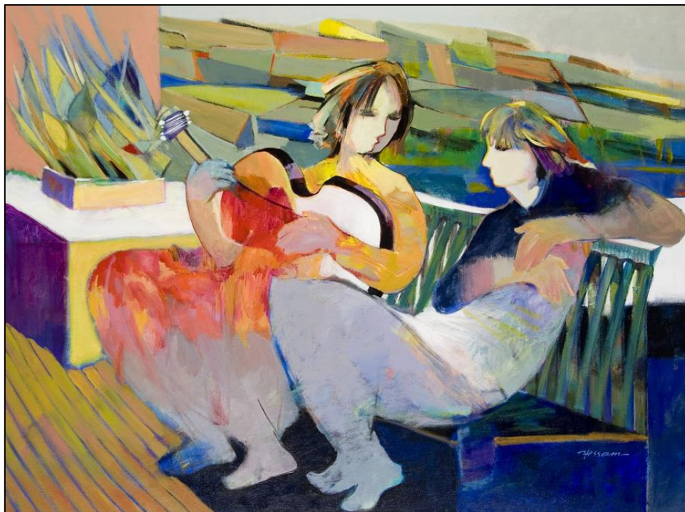
Summer Memories