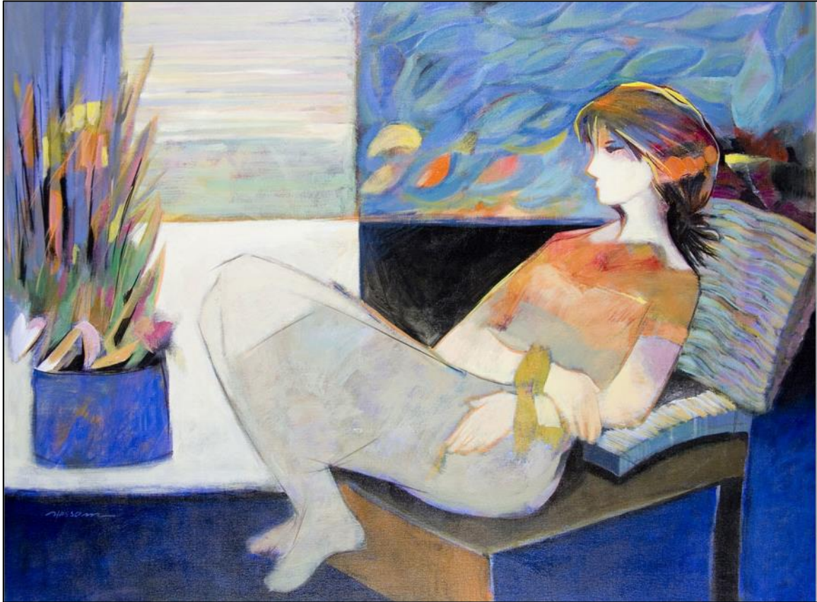
Joy of Blue - Copyright Hessam Abrishami 2017

In addition to an extraordinary collection of artwork and custom-framing, Ocean Galleries also offers a variety of hand-made crafts from local, regional, and national artists in America, such as glass, pottery, jewelry, and furniture. All summer exhibitions take place at the Stone Harbor location of Ocean Galleries (9618 Third Avenue), which is open from 10:00 AM until 10:00 PM daily through Sunday, September 3. Beginning September 4, the Stone Harbor gallery hours are 10:00 AM until 5:00 PM daily. The Avalon, NJ location of Ocean Galleries (2199 Ocean Drive) is open daily from 9:00 AM until 5:00 PM through Labor Day. For more information on the galleries and fall/winter hours, call 609-368-7777 or visit oceangalleries.com