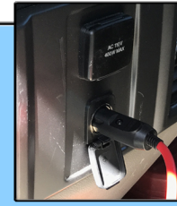
12-Ft. 12 VDC Cigarette Lighter Plug