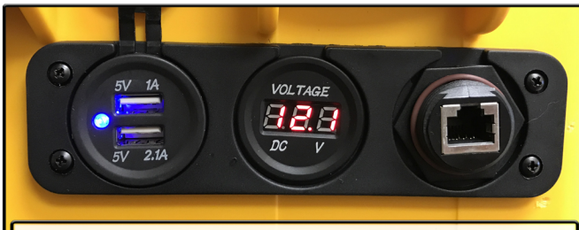
Front Panel: Dual USB Charging, Voltage Meter, Weatherproof RJ45

QuickNetCase® is completely configured and ready to operate inside of a watertight Pelican Storm Case™ (airplane carry-on friendly).