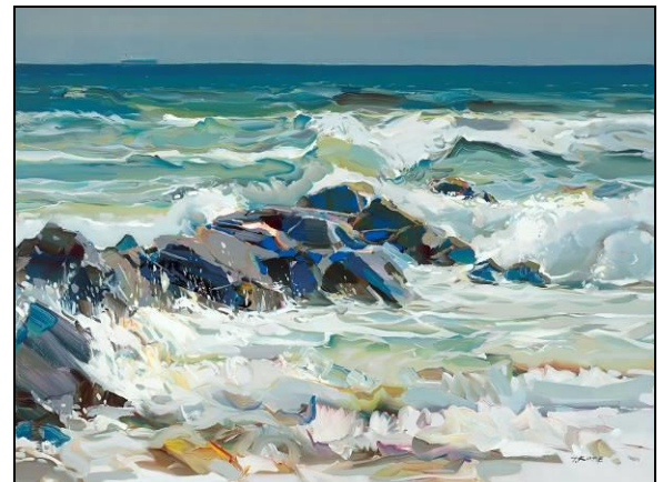
“Sound of Ocean Waves” Copyright ©Josef Kote 2018 All Rights Reserved

Saturday, May 26, 2018 7:00 PM to 10:00 PM Sunday, May 27, 2018 7:00 PM to 10:00 PM