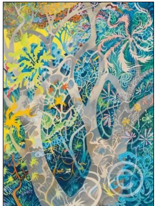
“Chase in the Forest” – Authorized Estate Edition

This July, Ocean Galleries will share a rare and compelling selection of artwork from 20 years of The Art of Dr. Seuss Collection . Visitors can explore and acquire works from Dr. Seuss's best-known children's books, as well as The Secret Art of Dr. Seuss , a mind-expanding collection based on decades of artwork that Dr. Seuss created at night for his own personal pleasure.