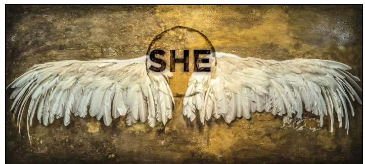
"The Power of She"

Sunday, September 2, 2018 6:00 PM to 10:00 PM