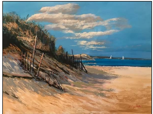
"On the Beach"

Saturday, August 4, 2018 7:00 PM to 10:00 PM