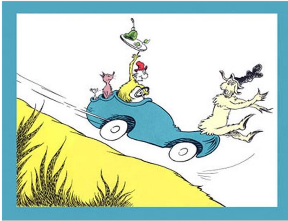
Would You? Could You? In a Car? Authorized Estate Edition