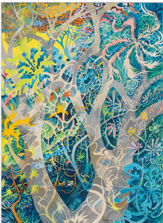
Chase in the Forest Authorized Estate Edition

The Art of Dr. Seuss Collection has become one of the most comprehensive projects ever undertaken for a deceased artist. Nearly 300 gallery, museum, and public exhibitions have been mounted in this country and abroad over the past 20 years, garnering both critical and popular attention from the art world and the collecting public. Three major coffee table books have been published on The Art of Dr. Seuss Collection and 77 limited editions of Seuss imagery have now sold out. Most importantly, Theodor Seuss Geisel (aka Dr. Seuss) has taken his rightful place among America’s greatest artistic talents of the 20th century.