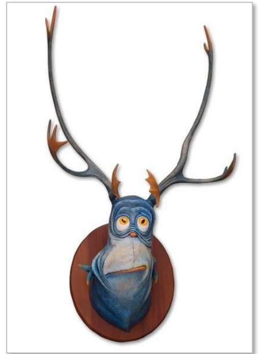
Sea-Going Dilemma Fish Authorized Estate Edition

Each of these Estate-Authorized limited editions has been adapted and reproduced from Theodor Seuss Geisel’s original drawings, paintings, or sculptures. Additionally, each work bears a posthumously printed or engraved Dr. Seuss signature, identifying the work as an authorized limited edition commissioned by the Dr. Seuss Estate.