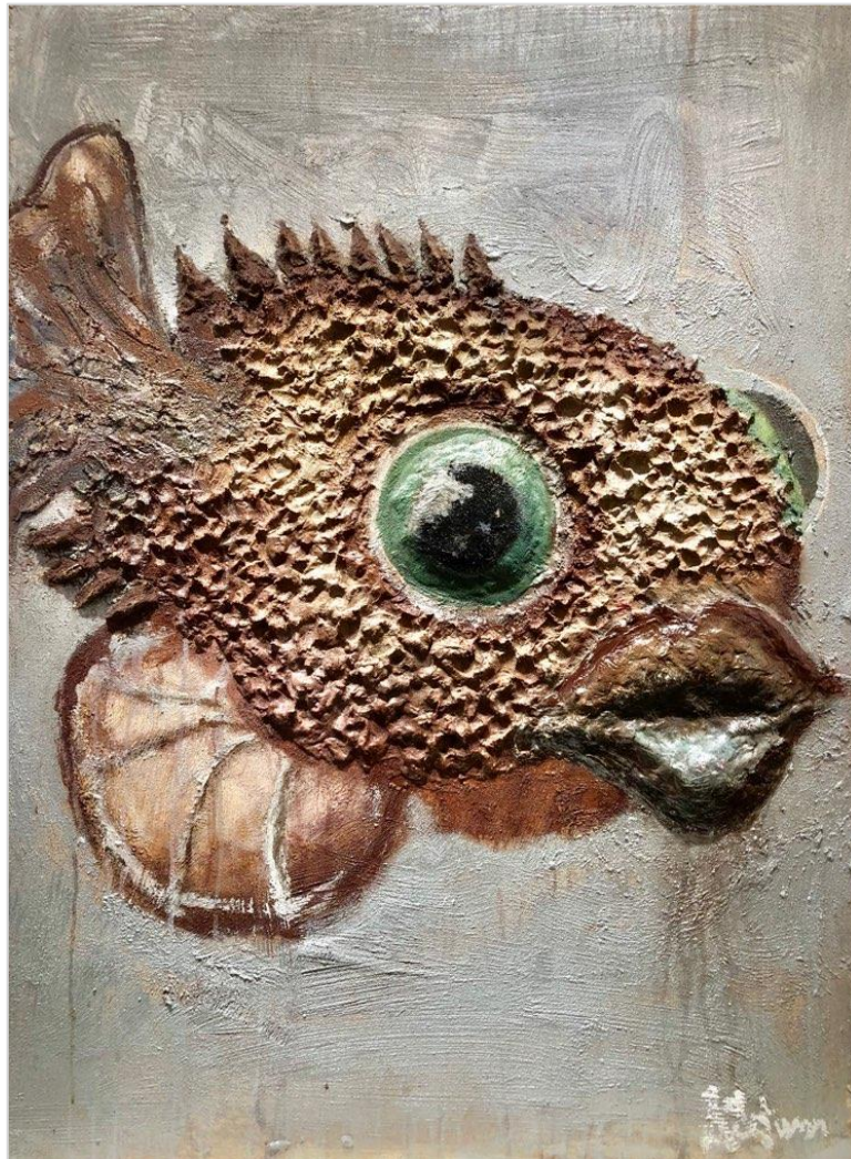
Prehistoric Puffer