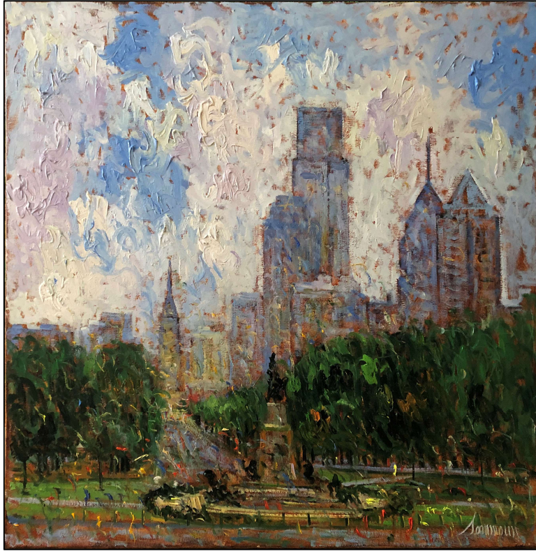
Philadelphia, View from the Museum of Fine Art, 30x30