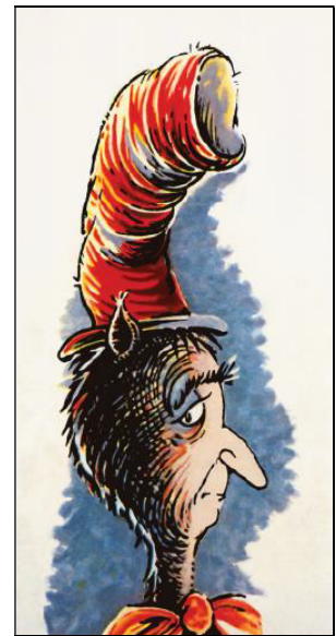
"The Cat Behind the Hat"