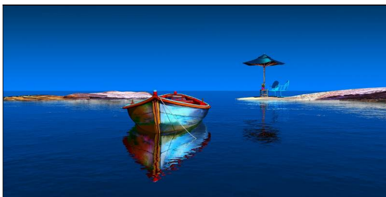
"40 Years Together"