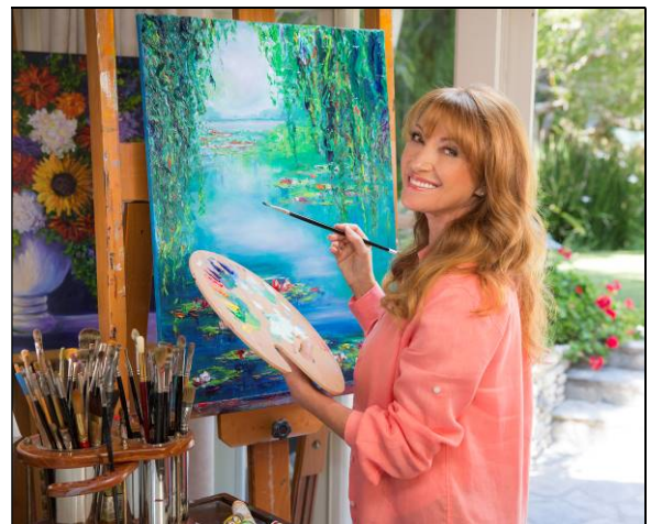
Jane Seymour works on her newest painting,

It is a thrill to welcome the multitaled Jane Seymour to Ocean Galleries over Labor Day weekend when she brings her latest collection of gorgeous oil paintings, watercolors, and bronze sculptures to Stone Harbor. Ms. Seymour began painting over 20 years ago as part of a healing process for personal challenges experienced at that time. Since then, Ms. Seymour has emerged as an established and accomplished painter, creating an intimate world of delicate watercolors, colorful vibrant oil paintings, pastels, and bronze sculptures. A multiple Emmy® and Golden Globe® winning actress, Jane Seymour has proven her talents in virtually all media, the Broadway stage, motion pictures, and television, and is an OBE (Officer of the Order of the British Empire) recipient. Additionally, she has written over 10 books and launched Jane Seymour Designs, a national lifestyle brand inspired by her homes, art, and family-centered lifestyle. Often described as a California colorist, Ms. Seymour believes that her art reflects the essence of who she is. Her collection of expressive art often reflects her passions in life, such as flower gardening, which is evident in her colorful flower arrangements, detailed landscapes, and lush garden paintings and watercolors. Ms. Seymour's new Ocean Galleries exhibition also includes numerous beachscapes and figurative paintings, many of which were inspired by her home life in Malibu, CA and recent visits to the East Coast.