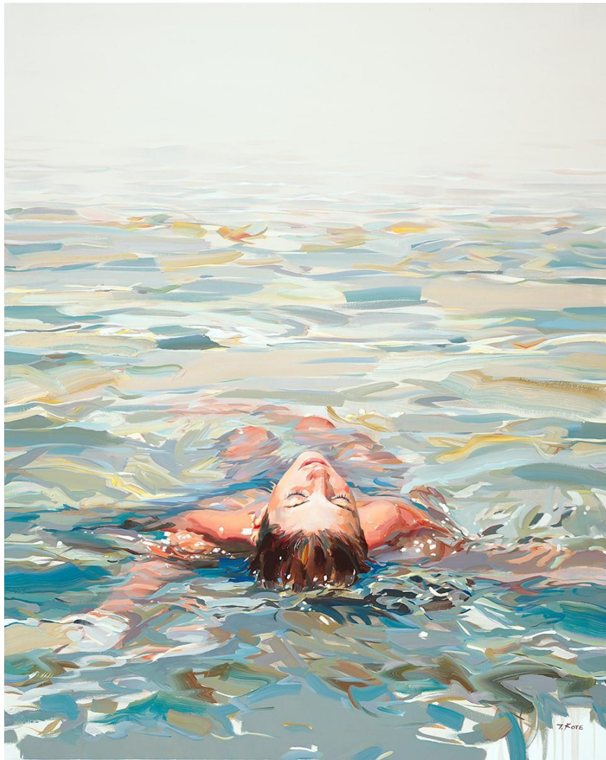
Letting Go, Copyright Josef Kote 2019

Having gained international recognition, Kote is best known for his distinctive style and technique which blend classic academic and abstract elements, fused together with his signature drip effect, to create breathtaking artwork. His paintings have been described as symphonies of light and color that are lyrically stunning and romantic, as well as edgy and current. Kote's trademark style includes bold brushwork and sweeping strokes of vibrant color - often through the use of a pallet knife - alongside monochromatic areas devoid of detail; the result of these unique techniques are paintings that enthrall the viewer with an incredible energy.