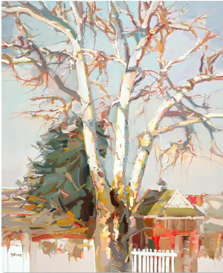
Great To Be Home