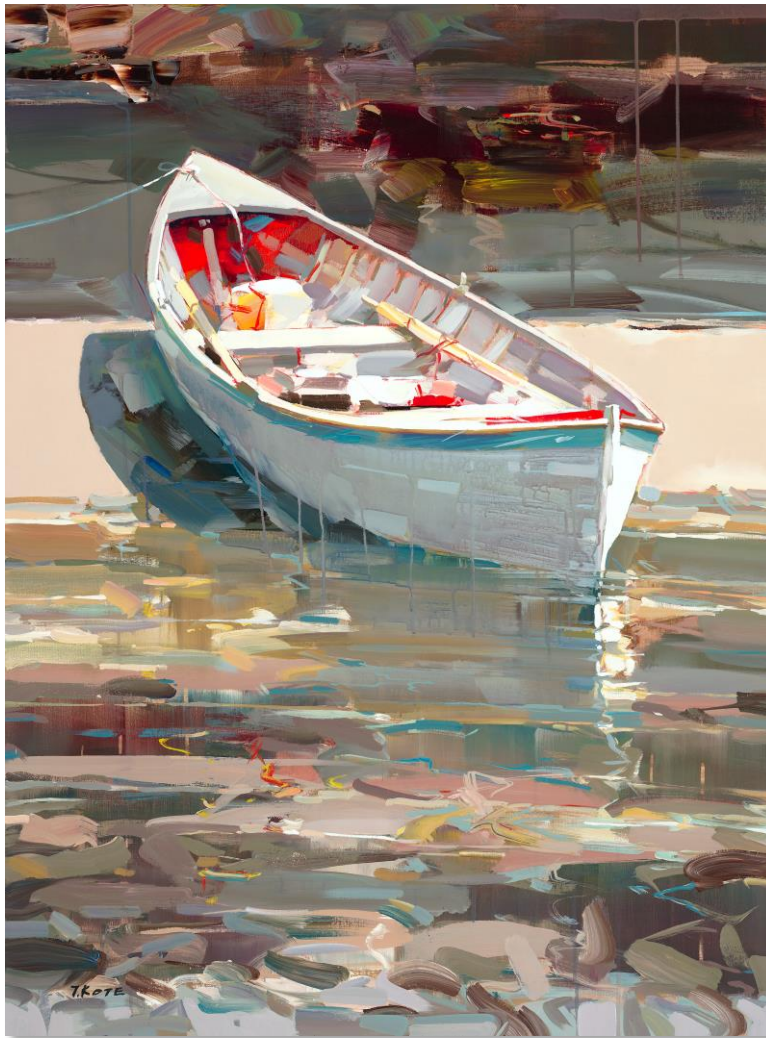
Almost There