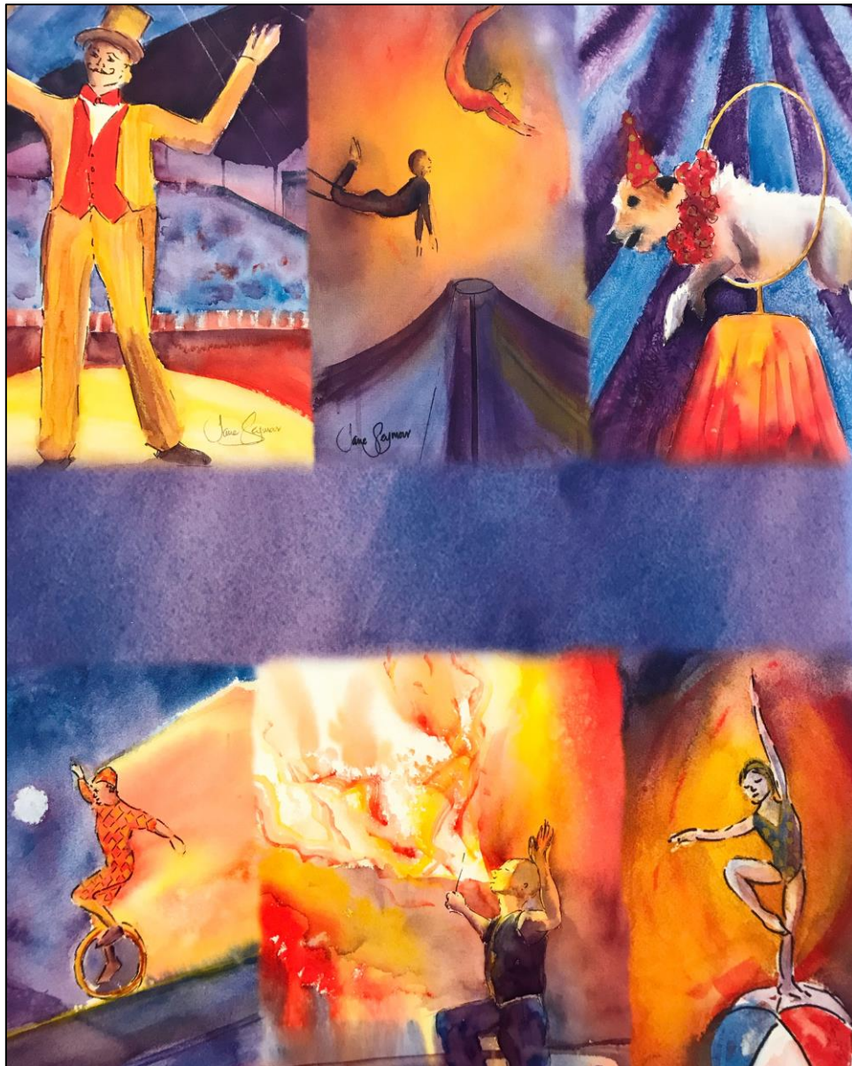
The Circus Suite

Ms. Seymour was selected as the official artist for the Naples (FL) Winter Wine Festival , the year following famed American painter Robert Rauschenberg. She was asked to create a series of paintings to be used as illustrations for the elaborate auction catalogue being produced for the world class charity's Fine Wine and Gourmet Chef event, benefiting the Naples Children and Education Foundation . The annual luncheon raises a staggering amount of money each year to help the disadvantaged children of Florida.