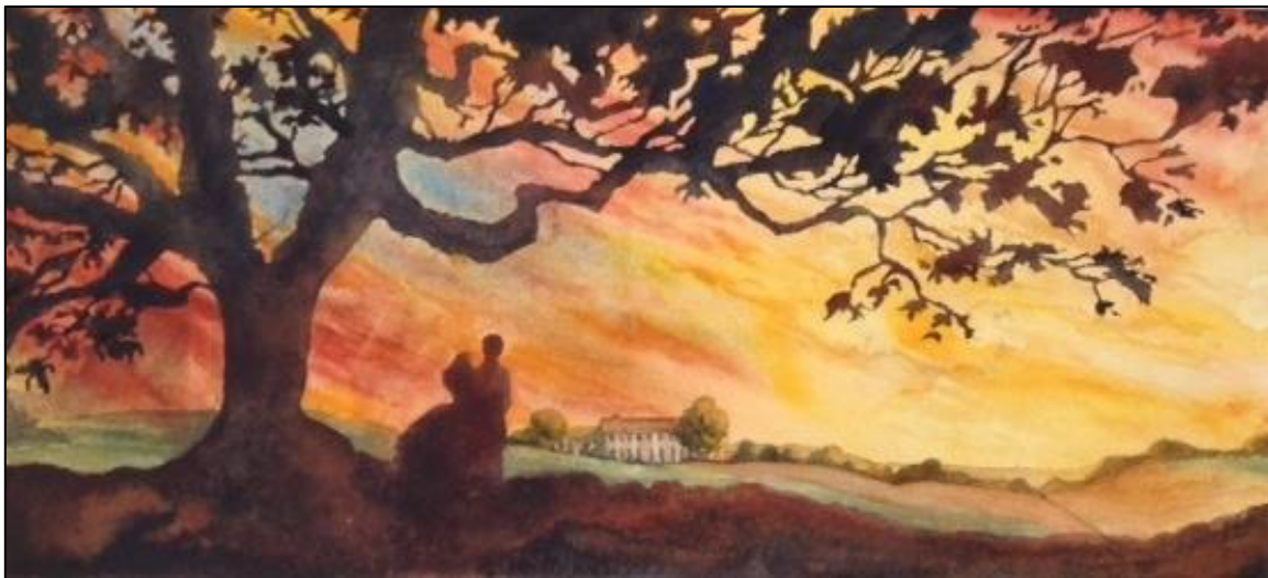
Tara (Gone with the Wind), Copyright Jane Seymour 2019

Ms. Seymour was one of 10 artists asked to create a painting of an influential classic film for the TCM 20 th Anniversary Project in 2014. Her favorite movie as a young girl was "Gone with the Wind," and 2014 marked the seventy-fifth anniversary of the film.