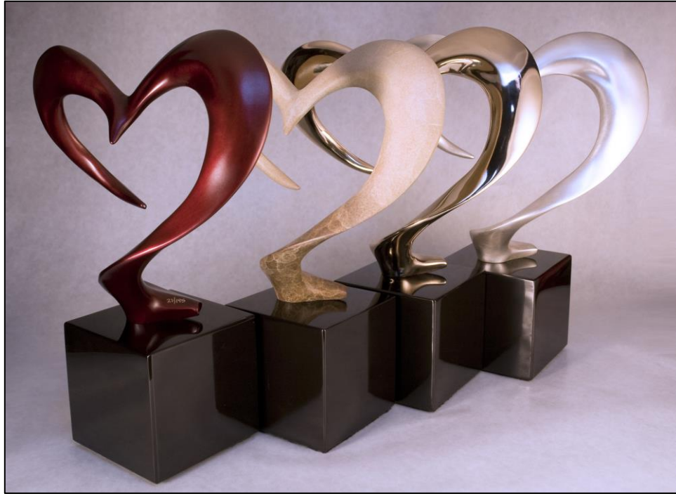
Single Open Heart Sculptures, Copyright Jane Seymour 2019

Jane Seymour clearly believes in giving back, as evident in her support of numerous charitable organizations , such as the American Red Cross , the Christopher and Dana Reeve Foundation , City Hearts , and others. She also cofounded the Open Hearts Foundation , a nonprofit charity established to raise funds to enrich the lives of children in the areas of health, arts, sports, and education.