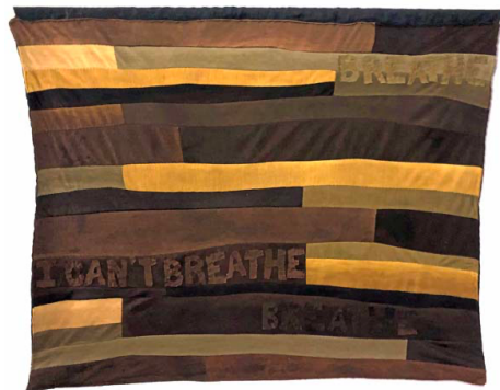
Nia Adams Simone Blended, 2020 Photograph