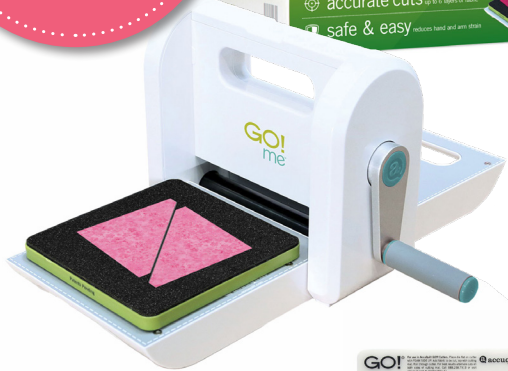
GO! Half Square & Quarter Square Triangle Dies