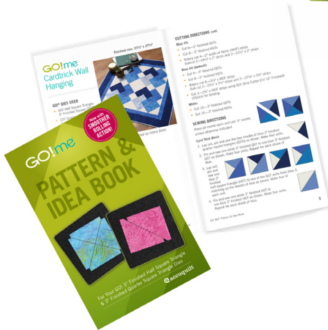
5 Creative Project Patterns