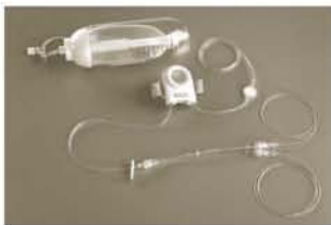
The ACCUFUSER® Post-Op Pain Control Pump with bolus-dose button and McKinley Saturation Catheter™.

Aesthetic surgery is booming in America, thanks to extensive media coverage that gives the public an eye-opening view of what plastic surgeons can do. As the population ages, people seem determined to stay youthful and lean as long as possible, and many of them are opting for appearance-enhancing procedures.