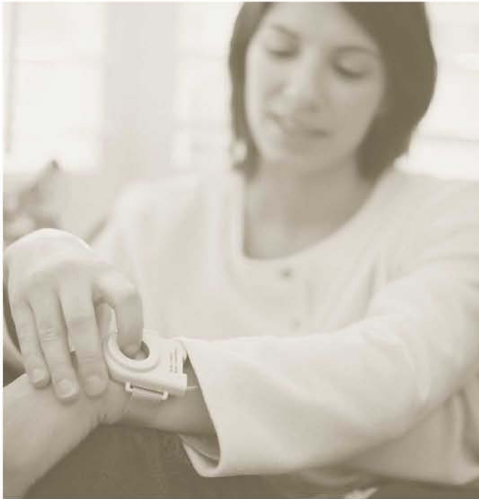
The ACCUFUSER® Post-Op Pain Control Pump features a unique bolus-dose button that patients can activate to relieve breakthrough pain after surgery.