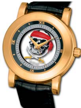
The three-hand watch „Jolly Roger“