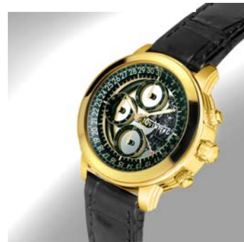
The chronograph „Sea Devil“