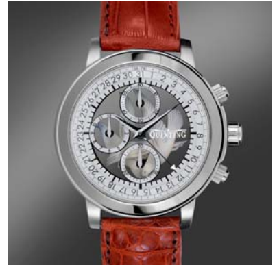
3. The chronograph „Dove of Geneva“ Limited edition