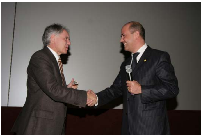
President of Switzerland in 2006, Moritz Leuenberger, becomes ambassador of Peace and of the Swiss watch manufacture, Quinting