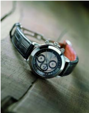
1. The chronograph „Mysterious Quinting“