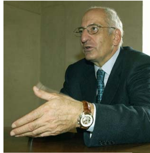
Bill Clinton and Pascal Couchepin, President of Switzerland in 2003, wearing their Doves of Geneva

The doves of this exceptional watch put on service to Peace and Democracy do not stay confined to Switzerland. Pascal Berclaz, the watchmaker of the Peace, whose transparent watches are showcased in the most prestigious jewellery shops of the main cities all over the world, makes his doves cross the borders to spread the message of Peace in every corner of the globe. On the international level after Bill Clinton (president of the United States from 1993 to 2001), it was the turn of the current president of Algeria, Abdelaziz Bouteflika, to become owner of this exceptional chronograph. The president who could restore peace and defeat terrorism in Algeria was presented this symbol of Peace by the Chamber of Commerce Switzerland- Algeria in June 2005 at the inauguration of the International Fair of Algeria, the most important annual event of this country.