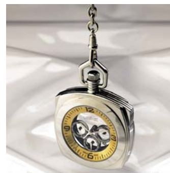
6. The double face pocket watch „Janus“ Limited Edition