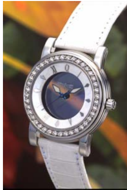
2. The three-hand watch „Transparency“