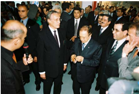
President of Algeria, Abdelaziz Bouteflika trying his Dove of Geneva

The doves of this exceptional watch put on service to Peace and Democracy do not stay confined to Switzerland. Pascal Berclaz, the watchmaker of the Peace, whose transparent watches are showcased in the most prestigious jewellery shops of the main cities all over the world, makes his doves cross the borders to spread the message of Peace in every corner of the globe. On the international level after Bill Clinton (president of the United States from 1993 to 2001), it was the turn of the current president of Algeria, Abdelaziz Bouteflika, to become owner of this exceptional chronograph. The president who could restore peace and defeat terrorism in Algeria was presented this symbol of Peace by the Chamber of Commerce Switzerland- Algeria in June 2005 at the inauguration of the International Fair of Algeria, the most important annual event of this country.