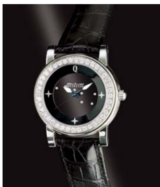
5. The three-hand watch „Telescopium“ Limited Edition